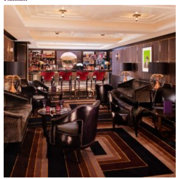
Art Deco Manetta's Bar