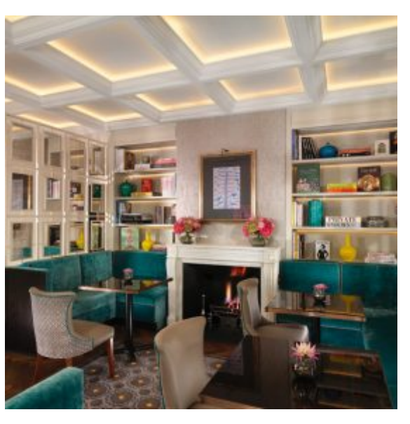
The Drawing Room