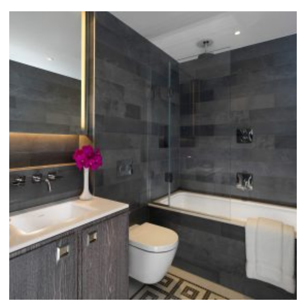
Under floor heated bathrooms