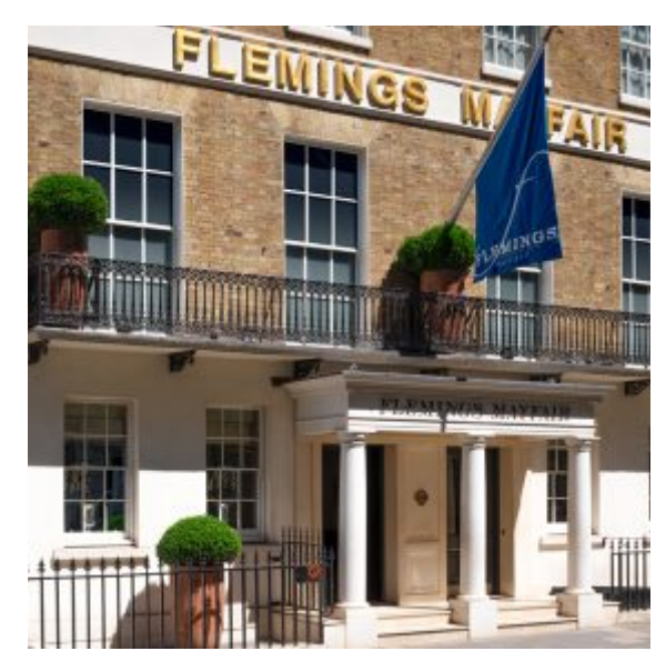
Exterior, located in the heart of Mayfair