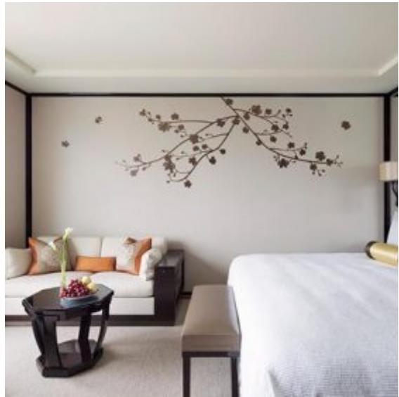
Grand Deluxe Harbour View Room