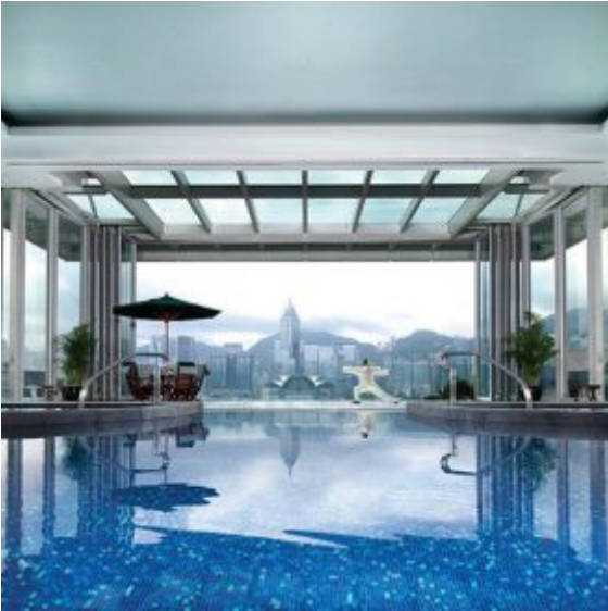
The Peninsula Spa Swimming Pool