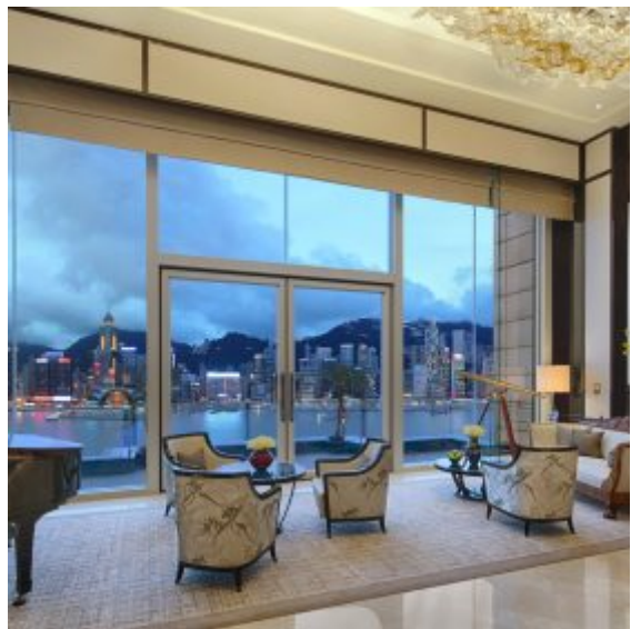
The Peninsula Suite