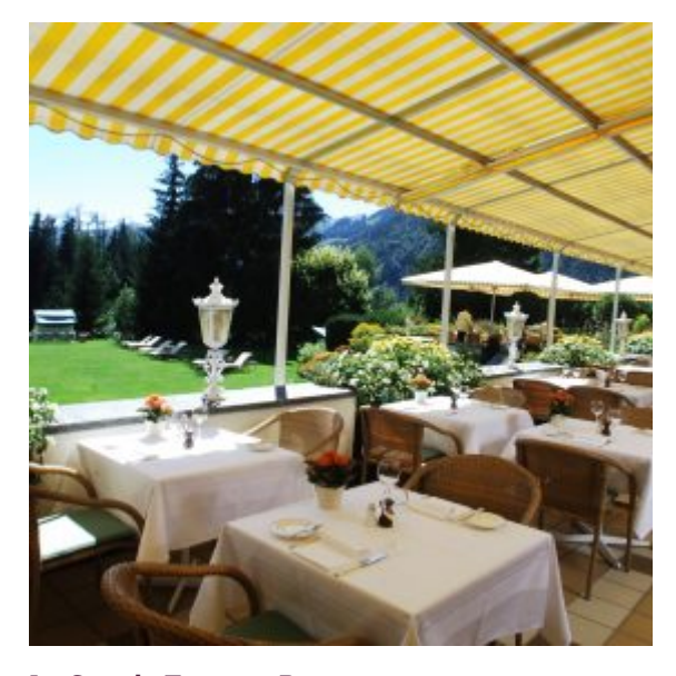
La Grande Terrasse Restaurant