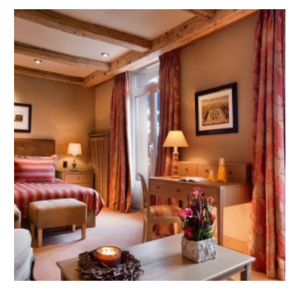
A Double Deluxe Room