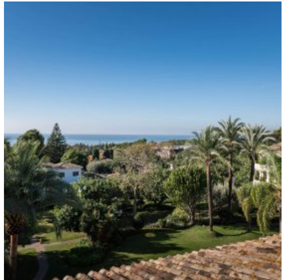
Buchinger Wilhelmi Marbella - sea view