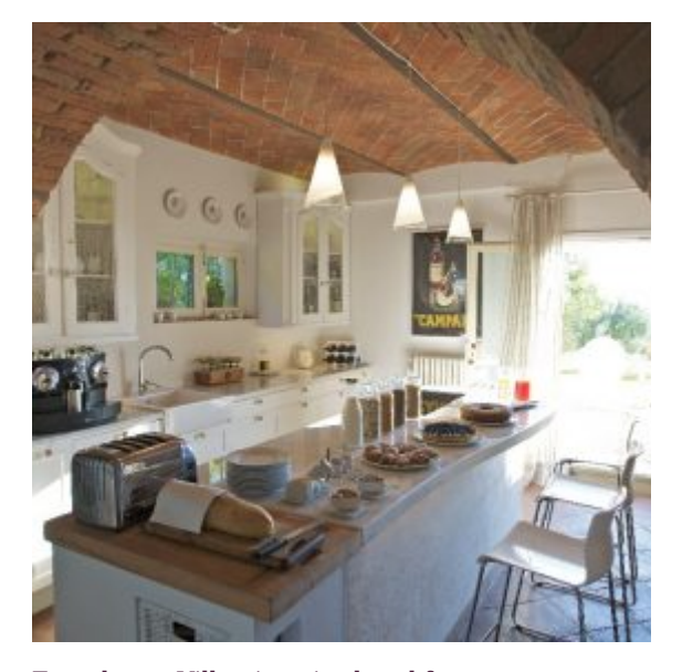
Fontelunga Villa - interior breakfast room