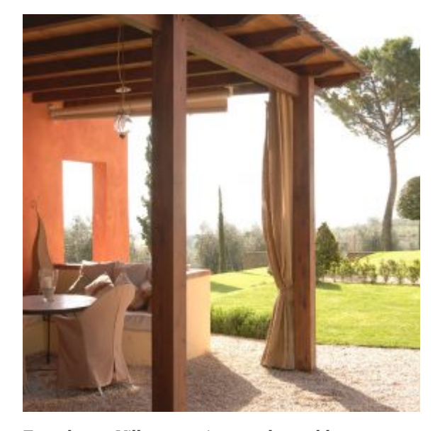
Fontelunga Villa - exterior gazebo and lawn