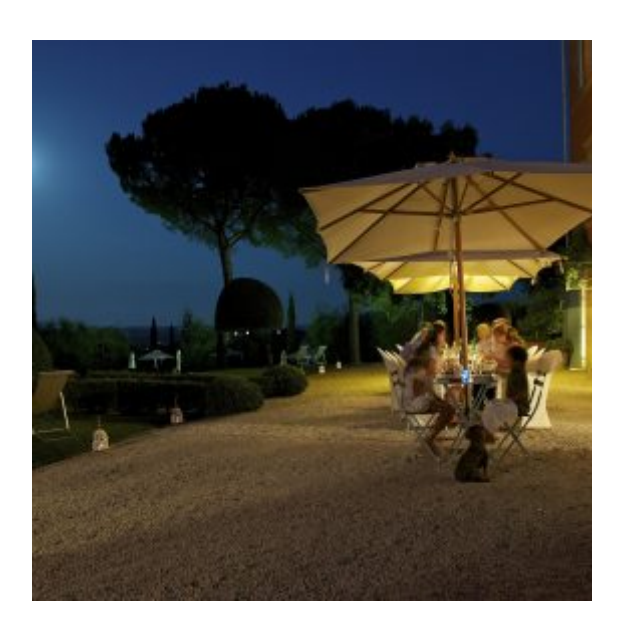
Fontelunga Villa - exterior dining on the terrace