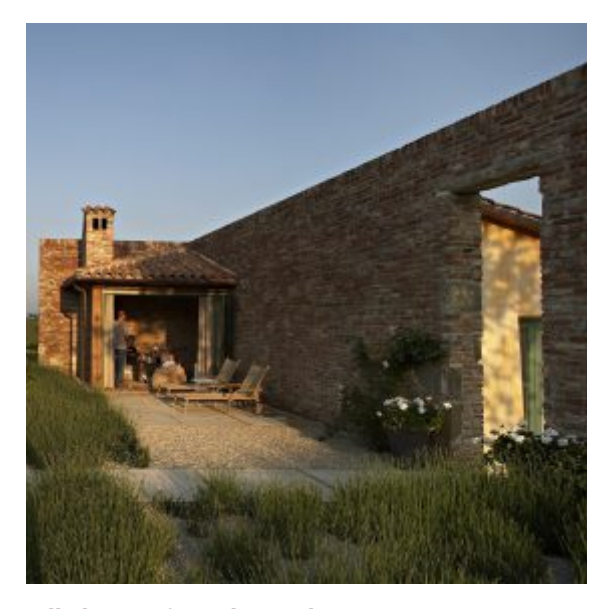
Villa lounge from the garden