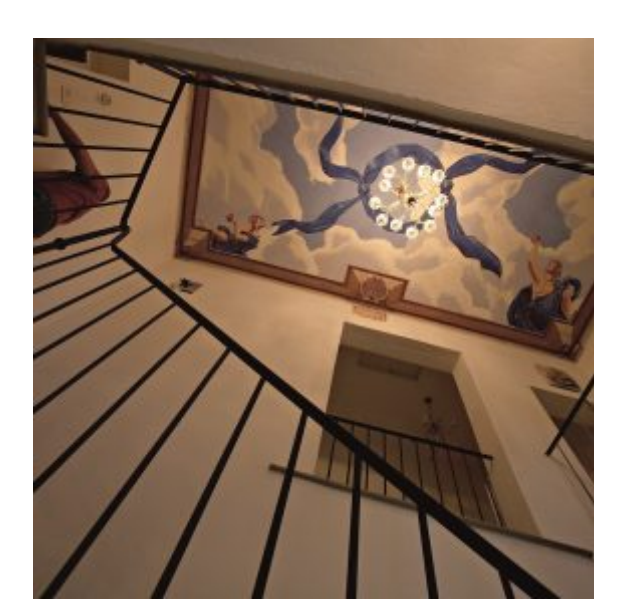
Villa interior hallway