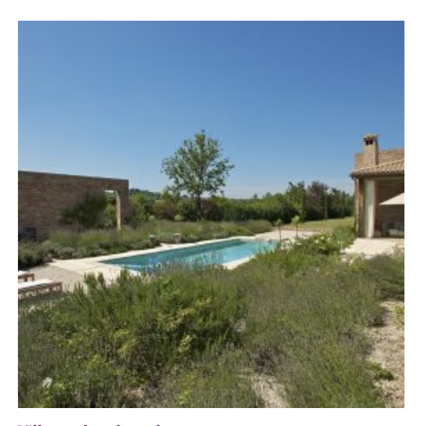
Villa pool and garden