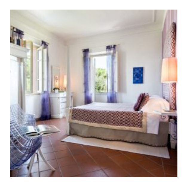
Fontelunga Villa - Ametista room