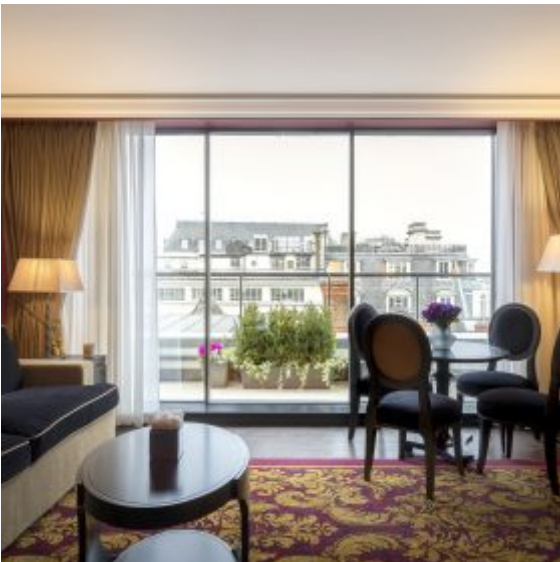
Duplex Suite living room