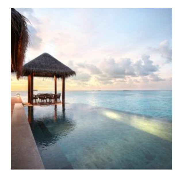
Three Bedroom Ocean Residence with 2 Pools_Deck