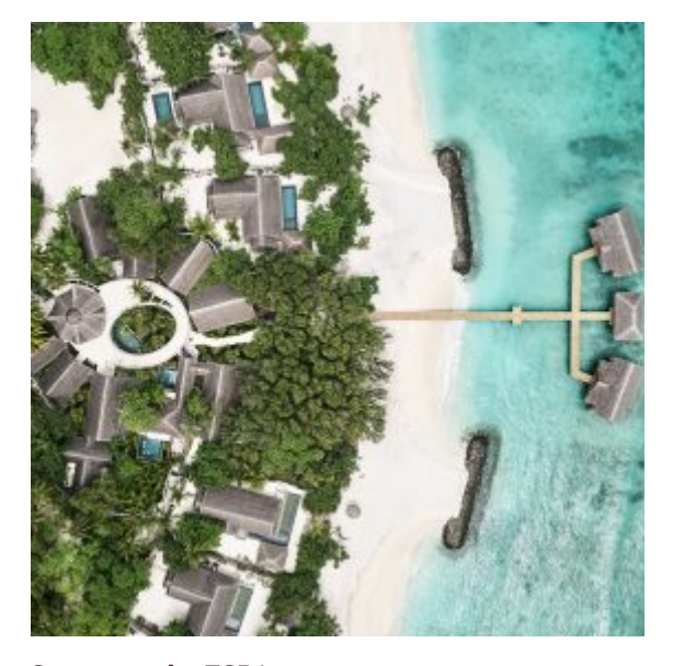
Spa centre by ESPA