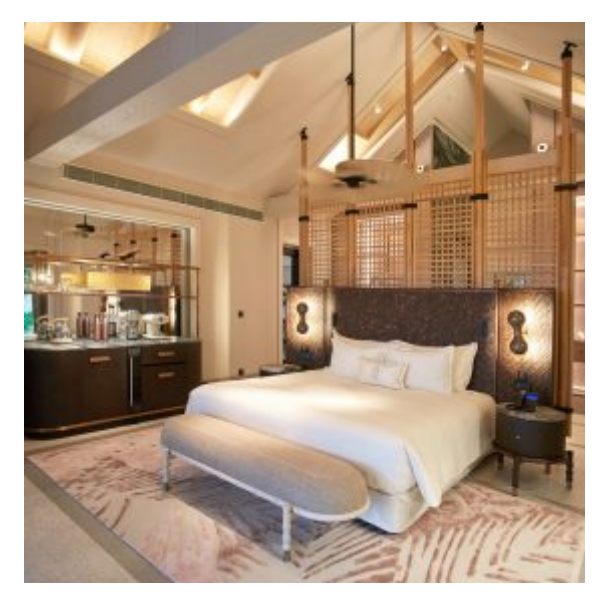
King Size Bedroom in Four Bedroom Beach Residence with \ensuremath{\mathsf{Pool}}