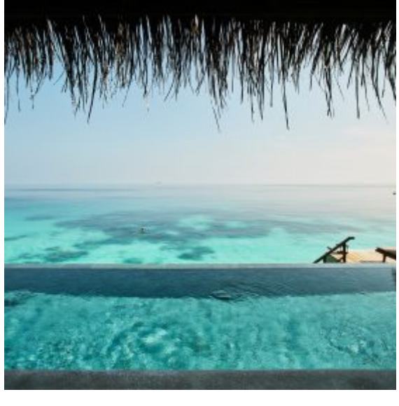
Water Villa with Pool