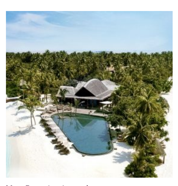
Mura Bar swimming pool area