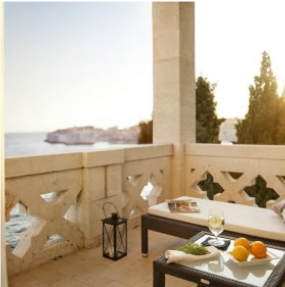
Villa Orsula Royal Suite balcony