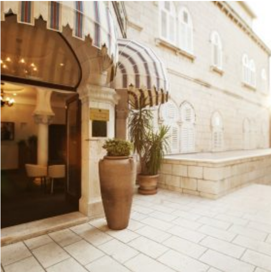
Villa Orsula entrance