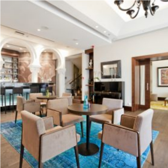
Villa Orsula Lounge