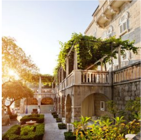
Villa Orsula Victoria Restaurant terrace