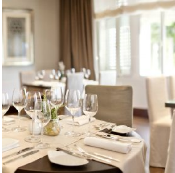
Villa Orsula Victoria Restaurant