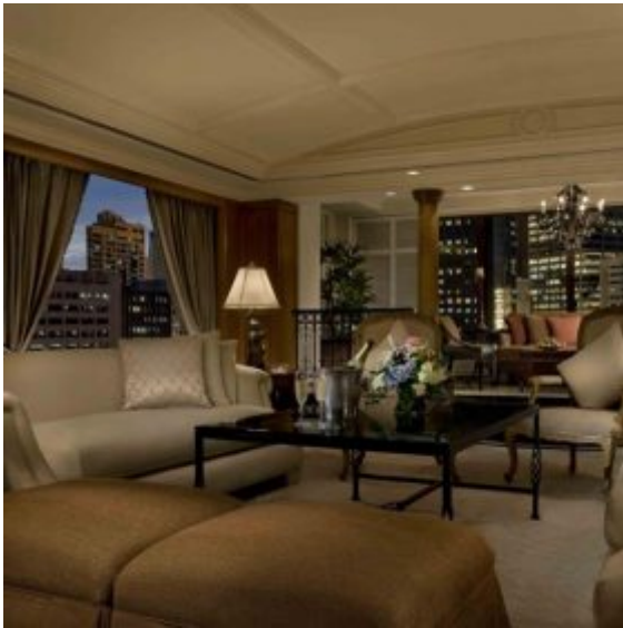
The Peninsula Suite Living Room