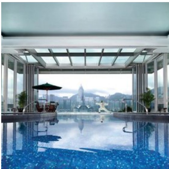
The Peninsula Spa Swimming Pool