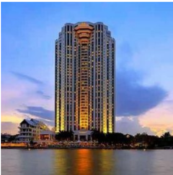
The Peninsula Bangkok exterior