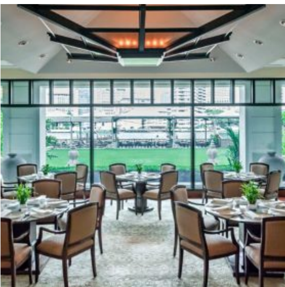
Mei Jiang Restaurant