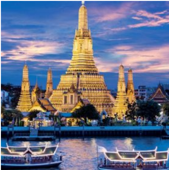
The Peninsula Bangkok boats on the river