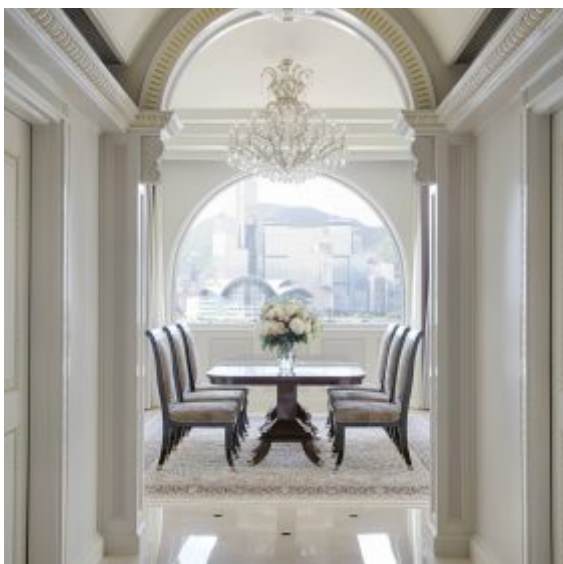
Marco Polo Suite