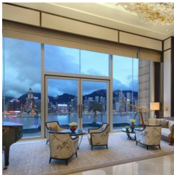
The Peninsula Suite