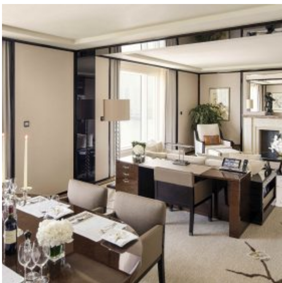
Grand Deluxe Harbour View Suite - Living & Dining Room