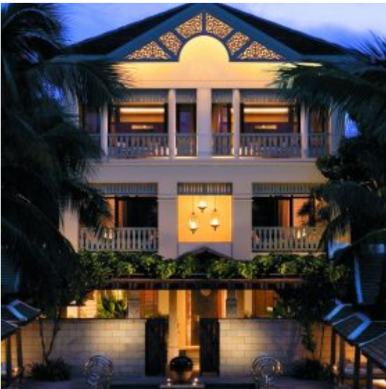
The Peninsula Bangkok SPA