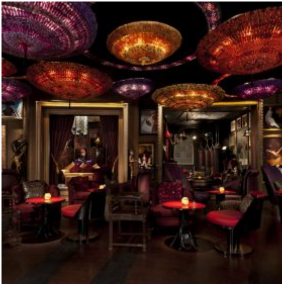
Salon de Ning Main Salon