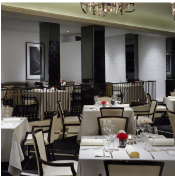
Old Manila Restaurant