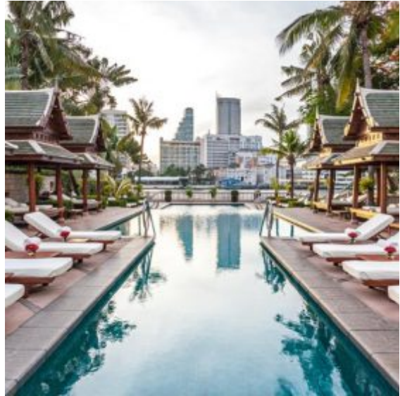
The Peninsula Bangkok poolside