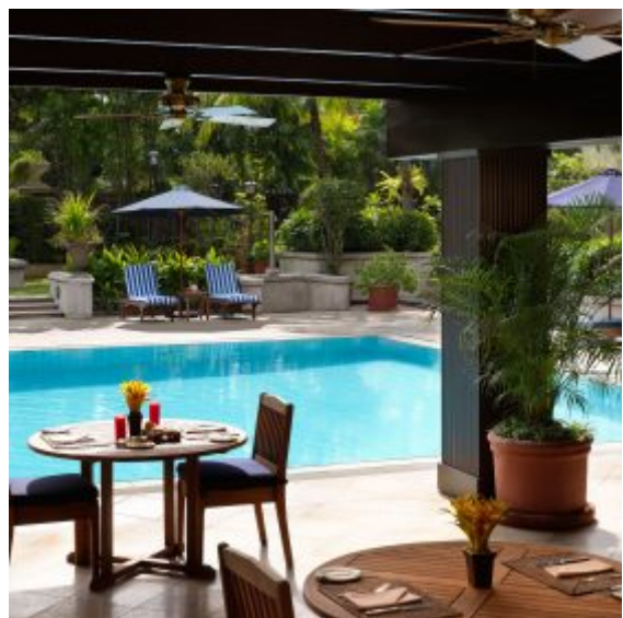
Pool Snack Bar