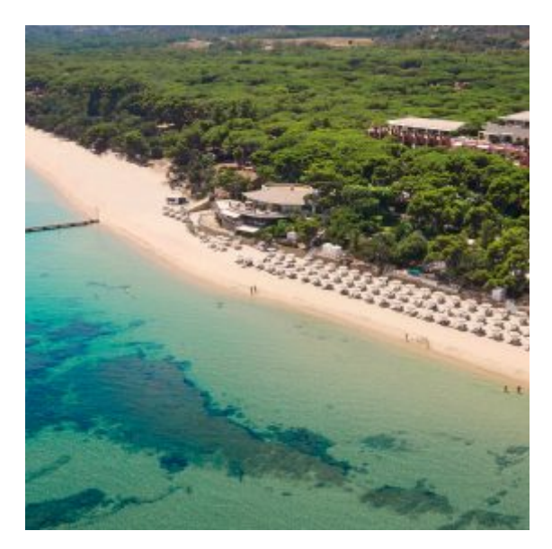
Forte Village Resort