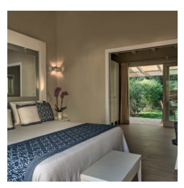
Buganville Deluxe Family Bungalow