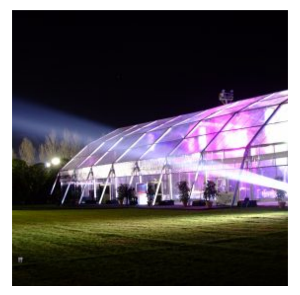
Forte Village Pala Forte