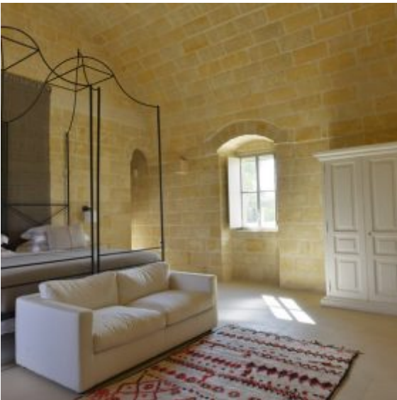
Trapana South Suite