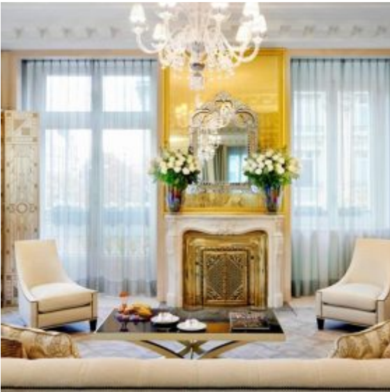
The Peninsula Suite - Living Room