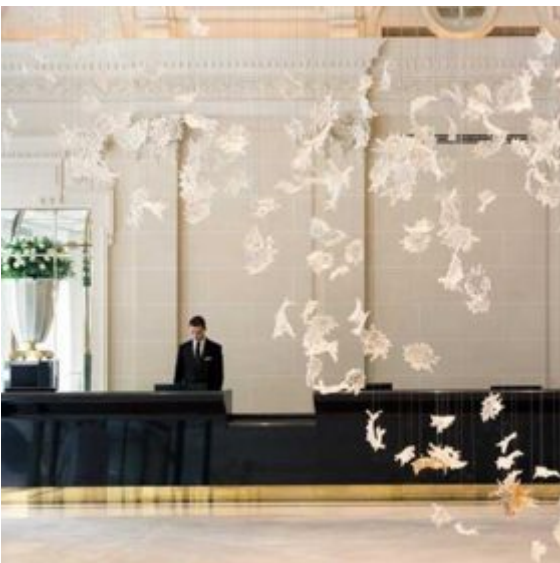
Entrance, with 'Falling Leaves' sculpture