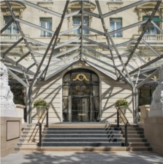
Hotel Facade- Avenue Kléber