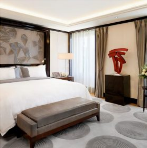
The Katara Suite