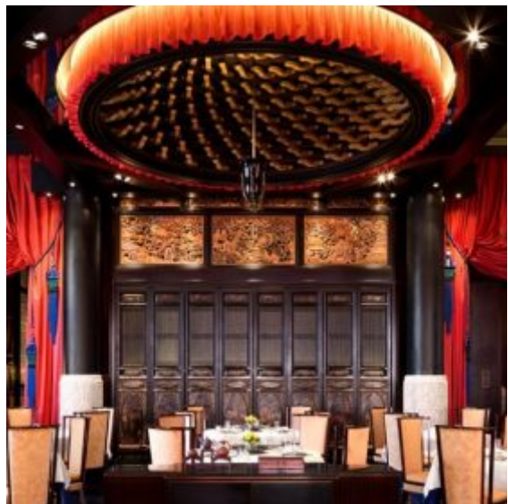
LiLi, Cantonese fine dining restaurant