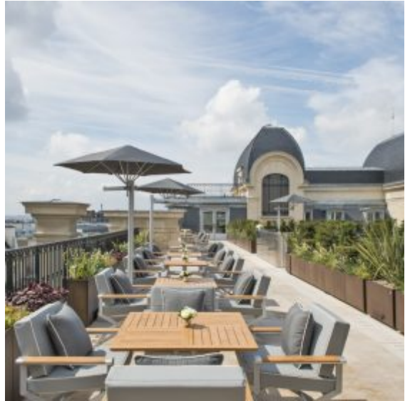
The rooftop terrace