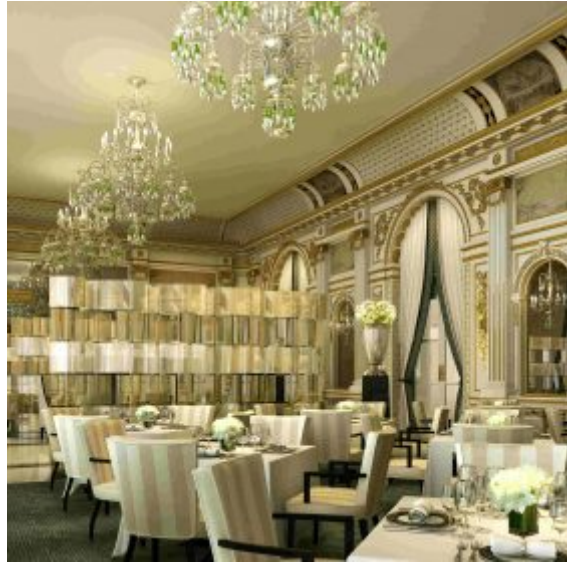
The Lobby restaurant