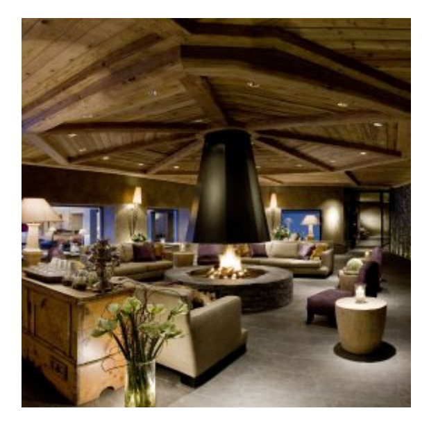
The Palace Spa Lounge