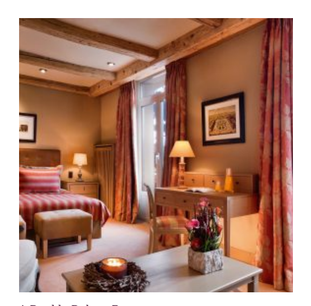
A Double Deluxe Room