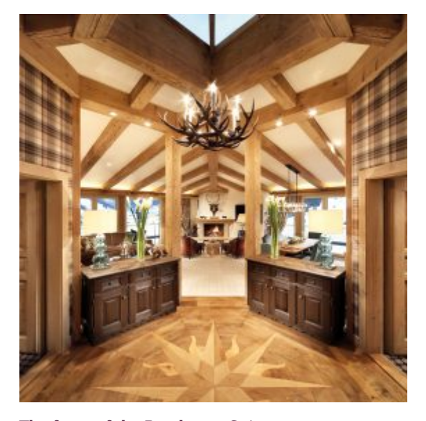
The foyer of the Penthouse Suite