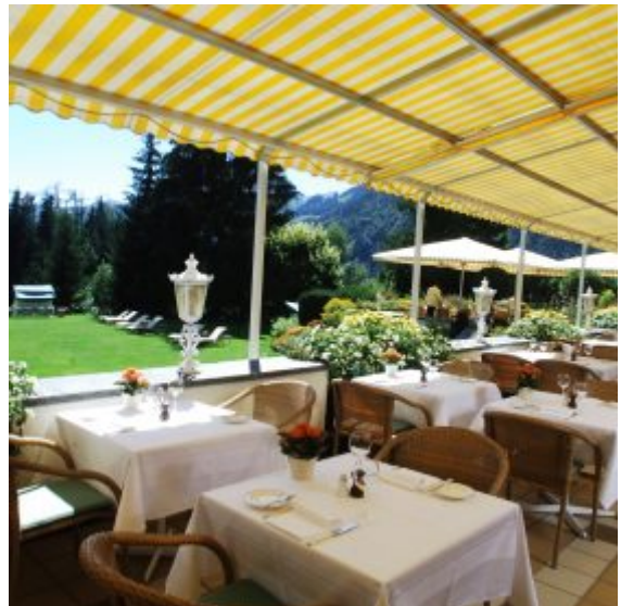
La Grande Terrasse Restaurant