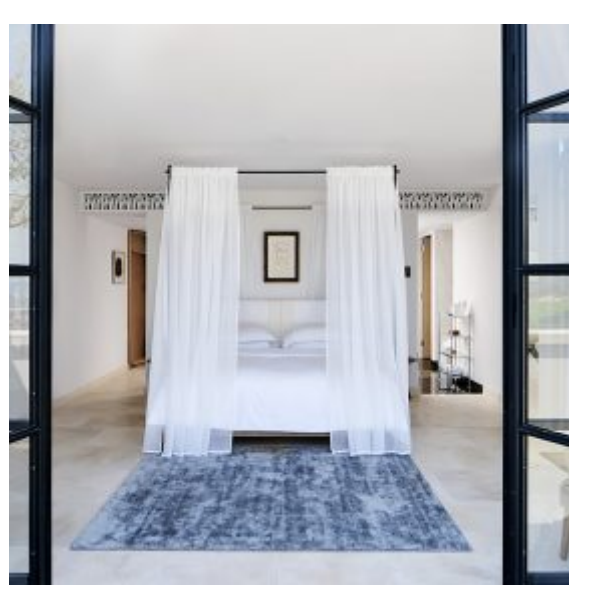
A Villa Suite, each offers zen uncluttered comfort with expansive views.