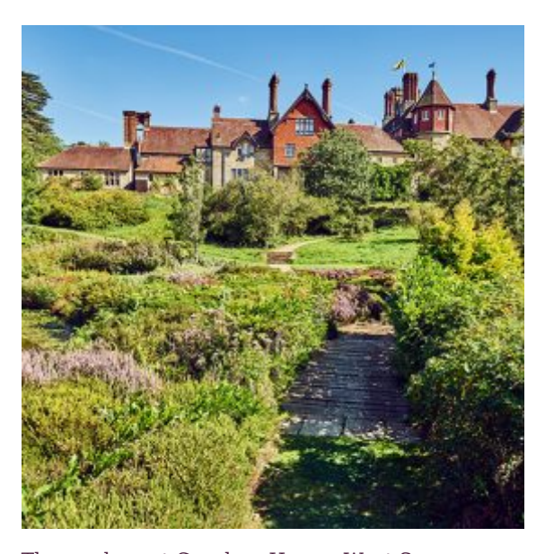
The gardens at Cowdray House, West Sussex