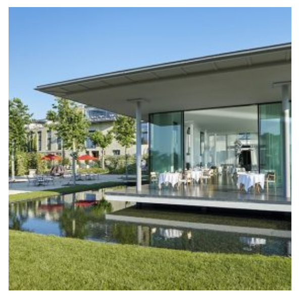
Château la Coste, the international destination for art, architecture and natural beauty