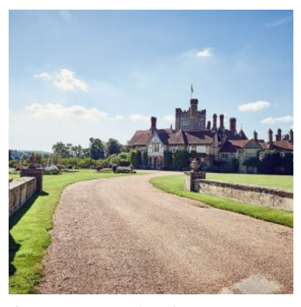
The 110-Acre Setting of Cowdray House, West Sussex