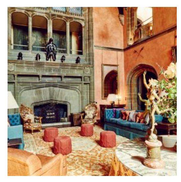
The Hall at Cowdray House, West Sussex