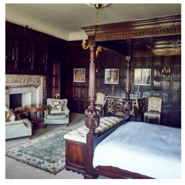
A bedroom at Cowdray House, West Sussex