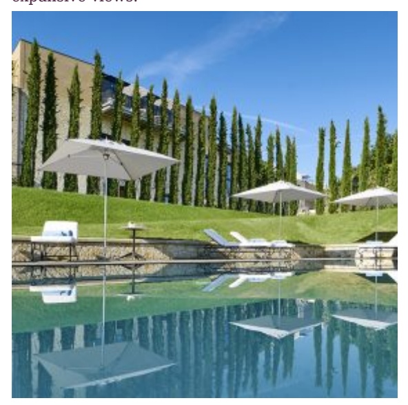
The Pool at Villa La Coste