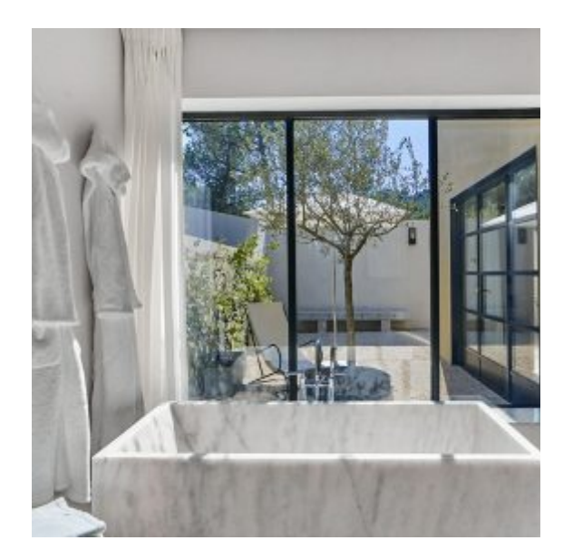
A Villa Suite at Villa La Coste