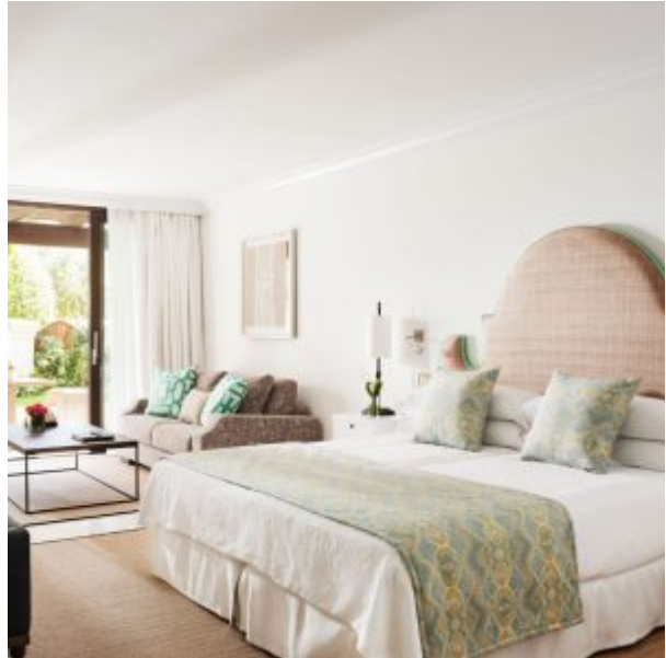
Double Deluxe Room