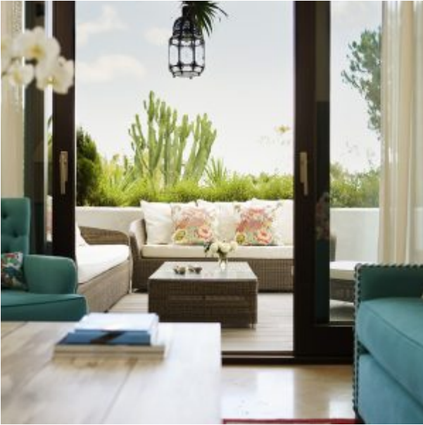
Suite Andalus Living Area