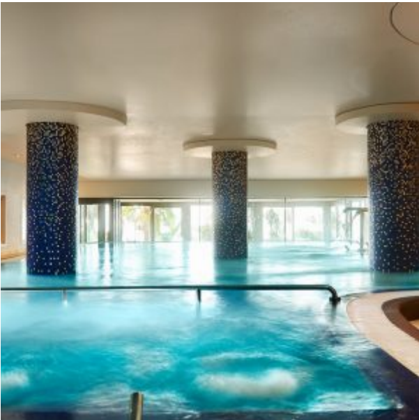
Marbella Club Spa