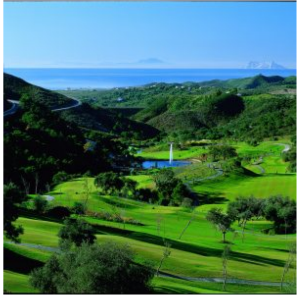
18-Hole Golf Course