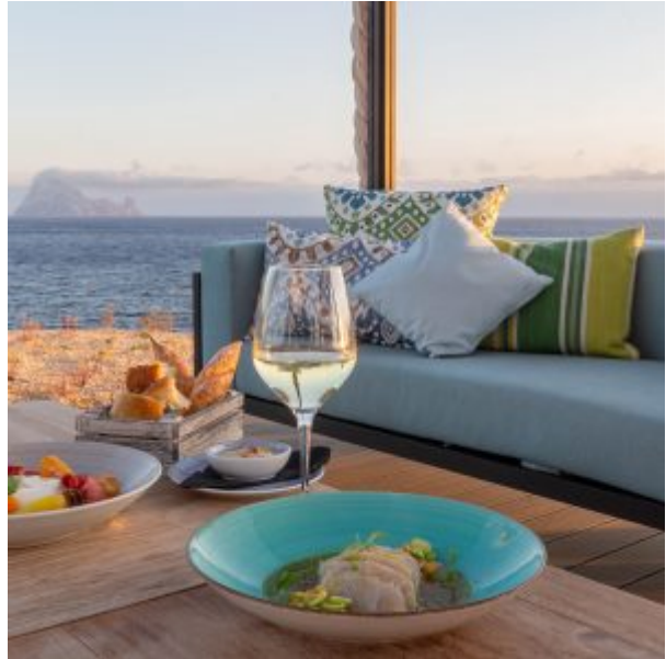
7Pines Dining - Cone Club Exterior View