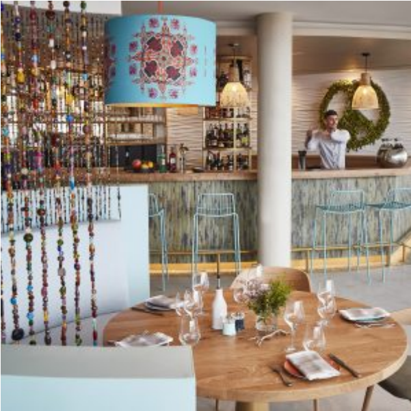
7Pines Dining - Cone Club