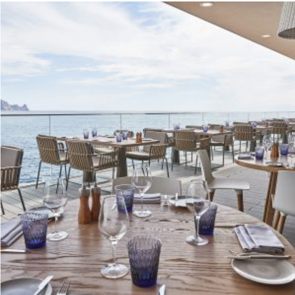
7Pines Dining- Exterior Sea View