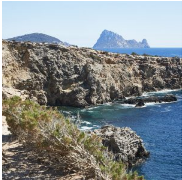
7Pines Dining - Exterior View Es Vedra