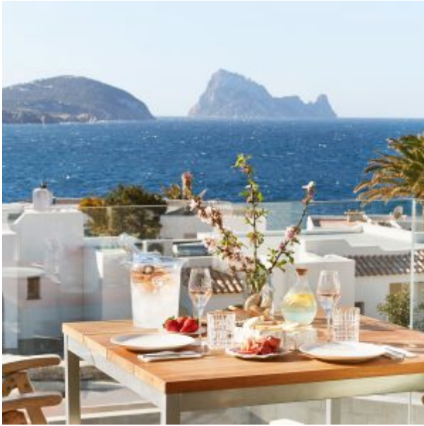
7Pines Laguna Suite Sea View