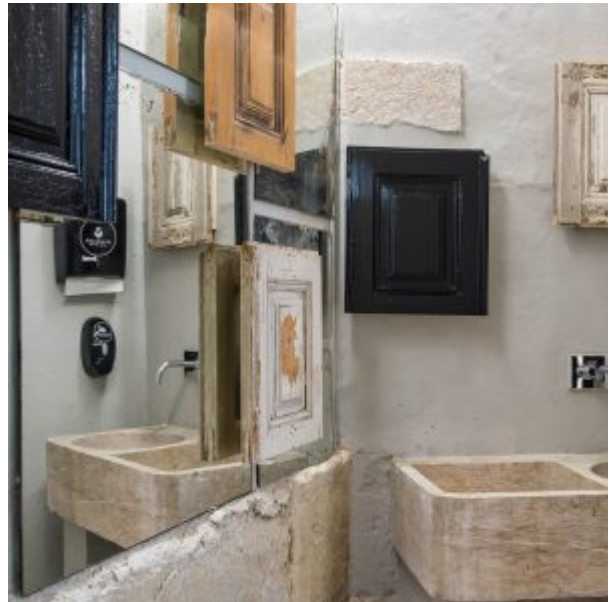
Interior public area