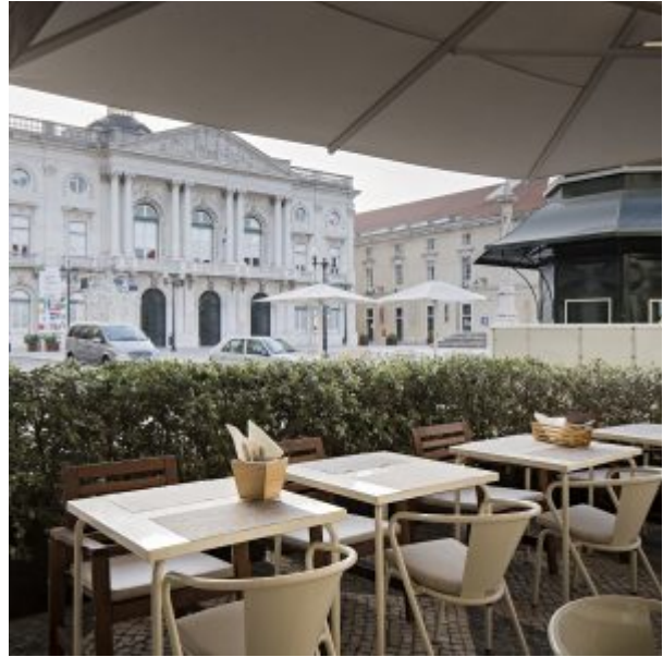
Terrace and view of the Square