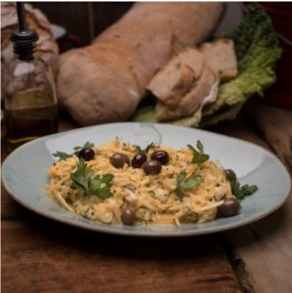
Delfina Restaurant cuisine