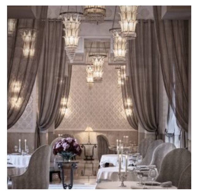
La Grande Table Française