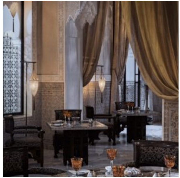
La Grande Table Marocaine