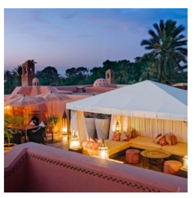
Le Jardin Pool Riad rooftop