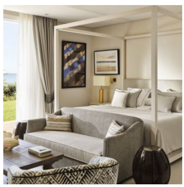
Villa Perez bedroom