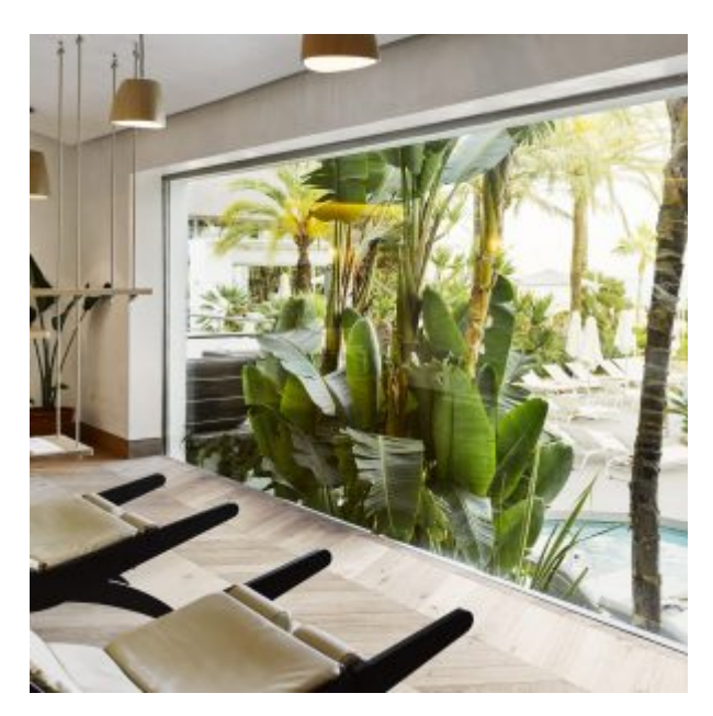
Six Senses Spa relaxation room