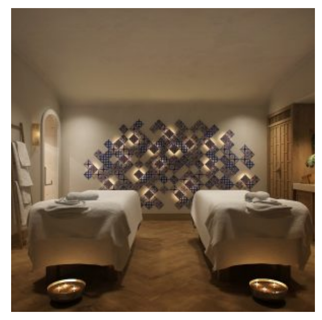
Six Senses Spa treatment room