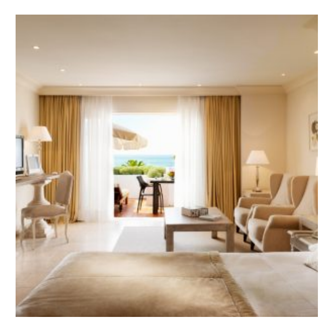
Grand Junior Suite