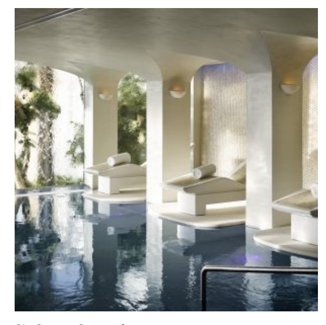
Six Senses Spa pool