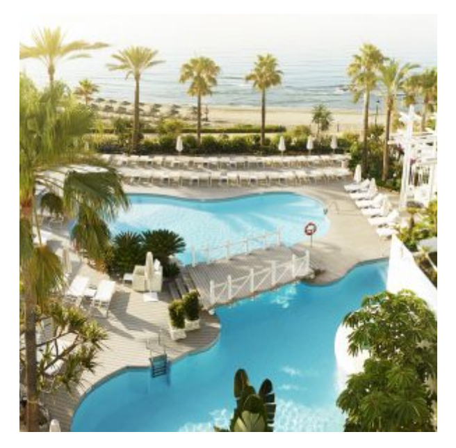
Puente Romano Pool