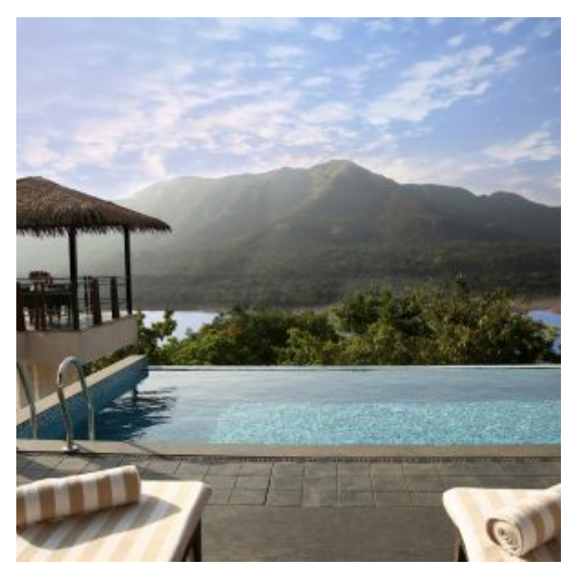
Mango Tree Villa pool and view