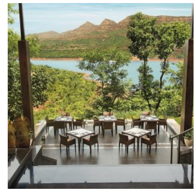
Dining pavilion and view