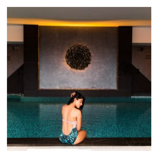
Salt water pool