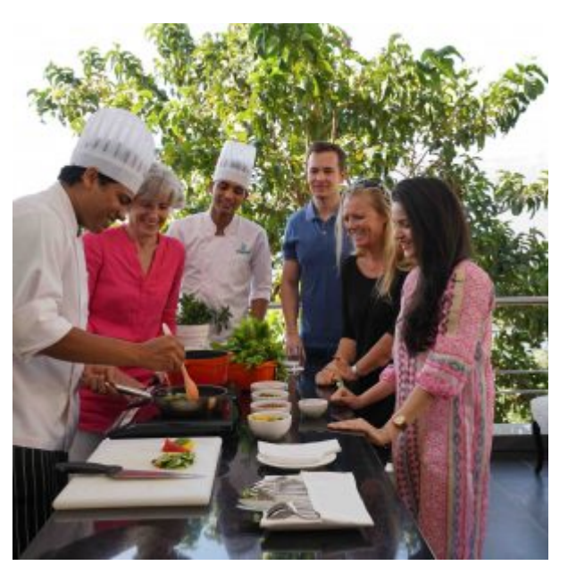
Spa Cuisine cooking classes