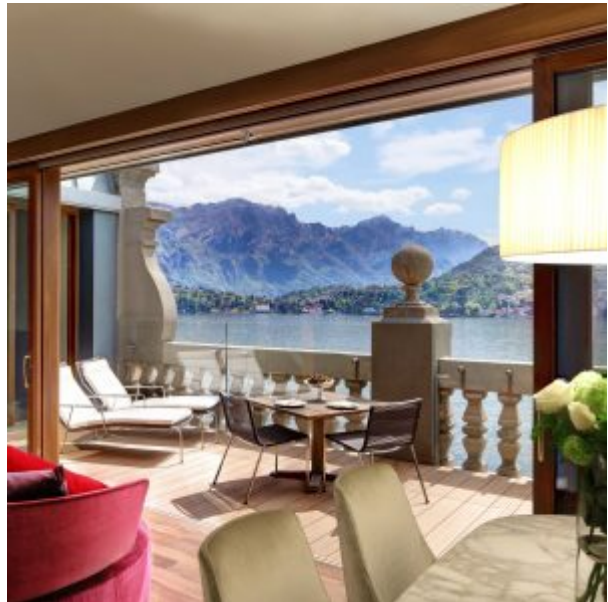
Rooftop Front Suite Living Room