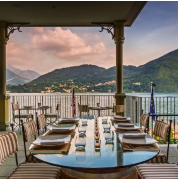
L'Escale Fondue & Wine Bar veranda