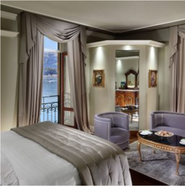
Lake View Deluxe Room