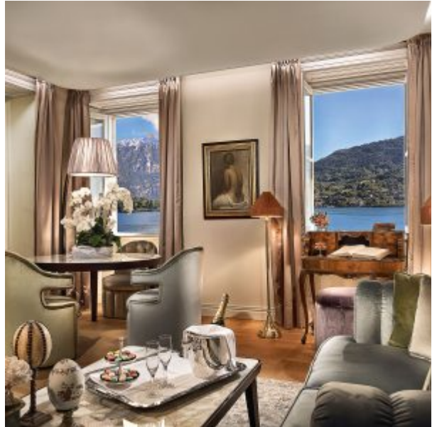
Suite Emilia - Living Room