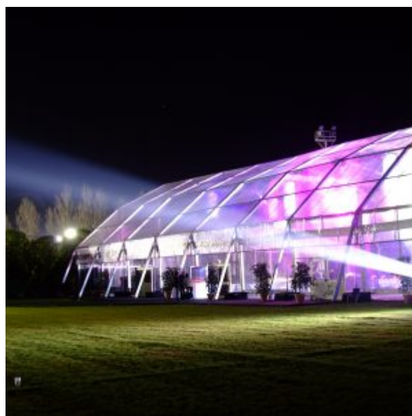
Forte Village Pala Forte