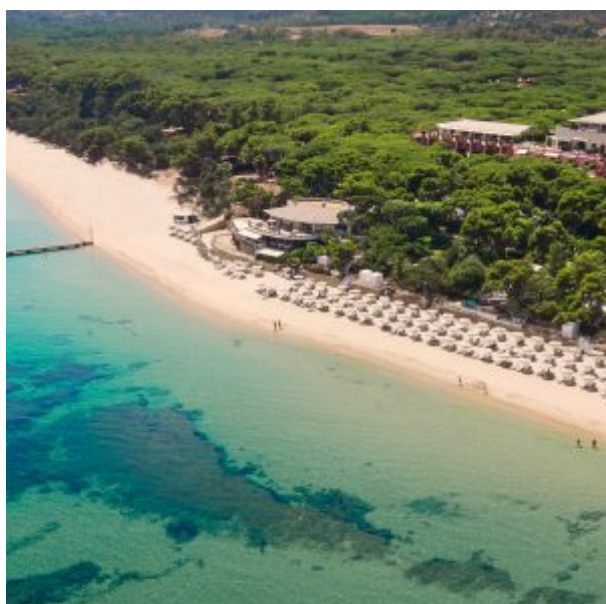
Forte Village Resort