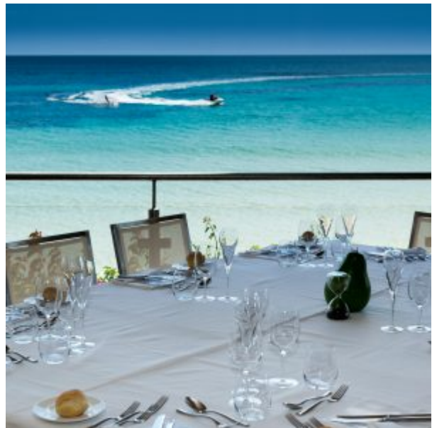
Ristorante Gordon Ramsay