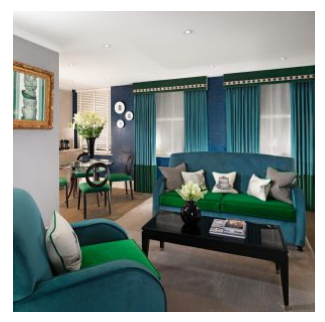
Flemings Mayfair Individually Designed Apartments