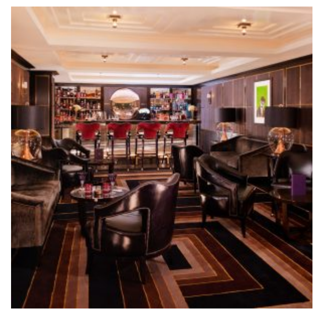
Art Deco Manetta's Bar