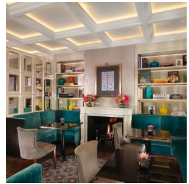
The Drawing Room, Indian inspired tea-room