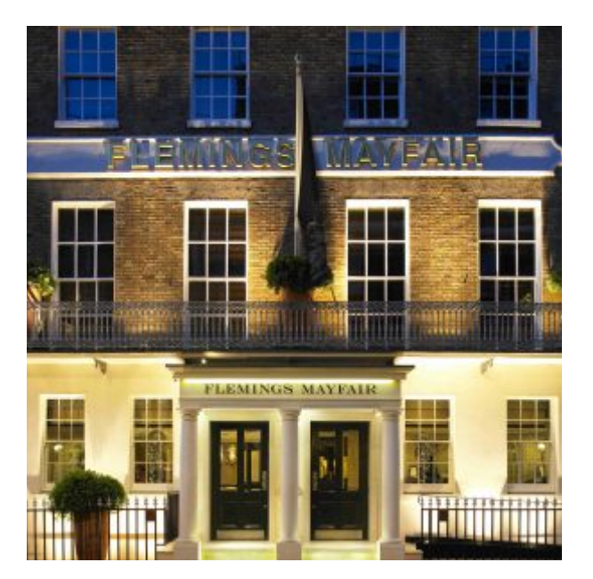
Located in the heart of Mayfair

In recognition of this joint venture, The Telegraph has highlighted the restaurant as being one of the top five hottest openings for summer 2016