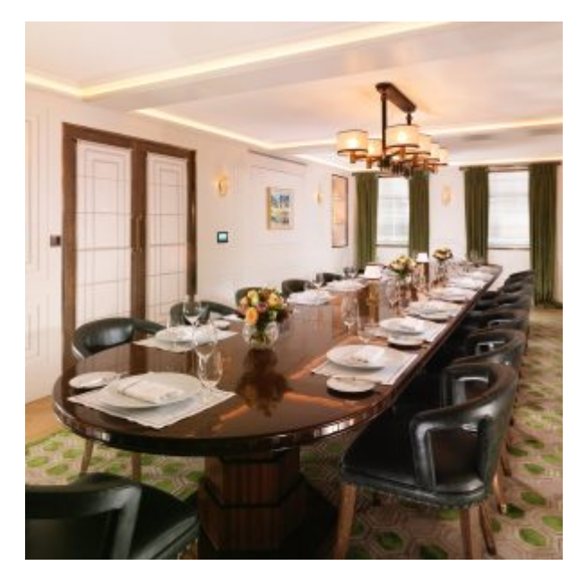
Clarges Suite for up to 20 guests