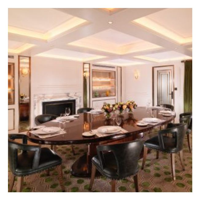
Half Moon Suite for up to 12 guests