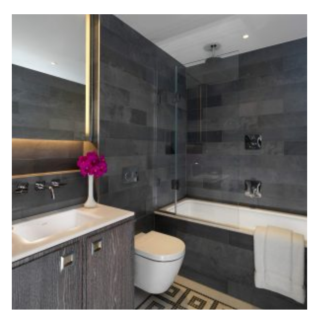
Under floor heated bathrooms