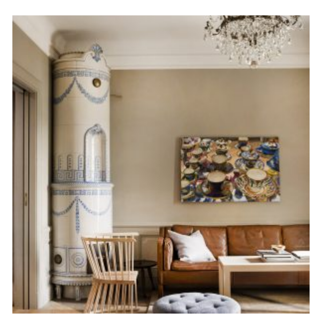
Lounge Area 4 - Design Detail