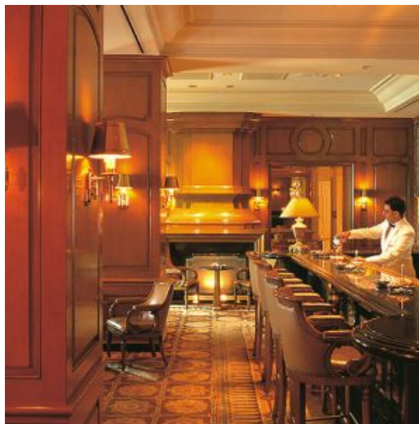
The Club Bar