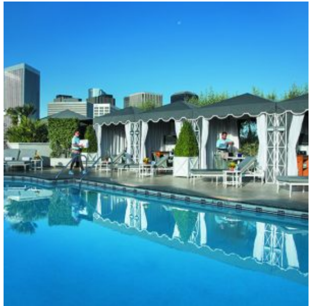
Roof Garden Cabana