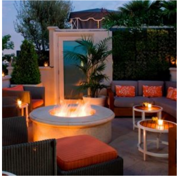
Roof Garden Fire Pit