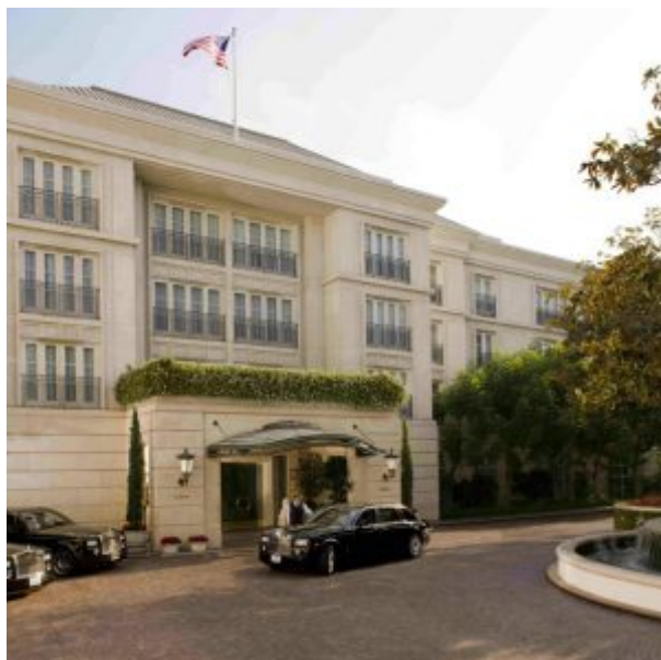
The Peninsula Beverly Hills Front Entrance

PenCities by LUXE City Guides showcases the very best of each Peninsula destination, with an exclusive and unique online luxury lifestyle journal spanning all ten Peninsula cities.