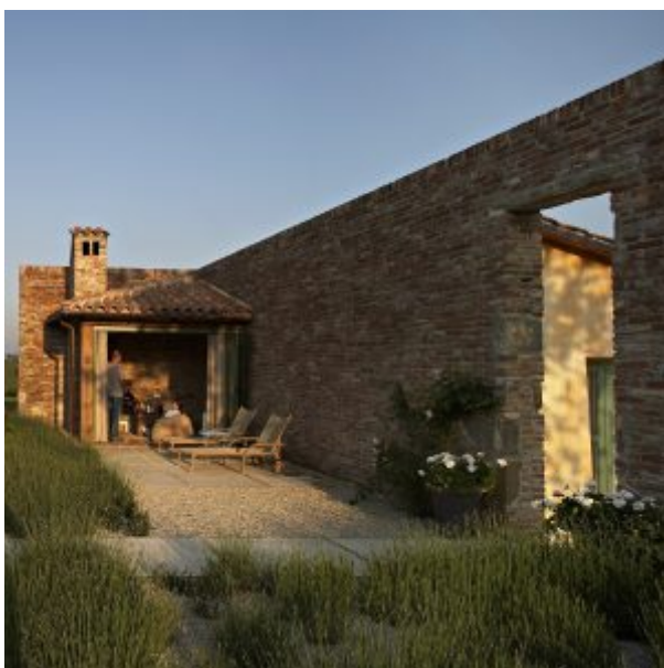
Villa lounge from the garden

Fontelunga seamlessly blends the colours and textures of traditional Tuscan style with contemporary design and facilities. Bedrooms are styled with shabby-chic furniture in white washed tones and luxuriously vibrant fabrics, while the communal areas compliment the building's traditional interior brickwork - including brick barrel vaulted ceilings and kitchen open fireplace - with vintage furnishings, frescoed ceilings and unique artworks by the likes of Guttuso and Canevari, as well as London-based painter Jim Hanlon.