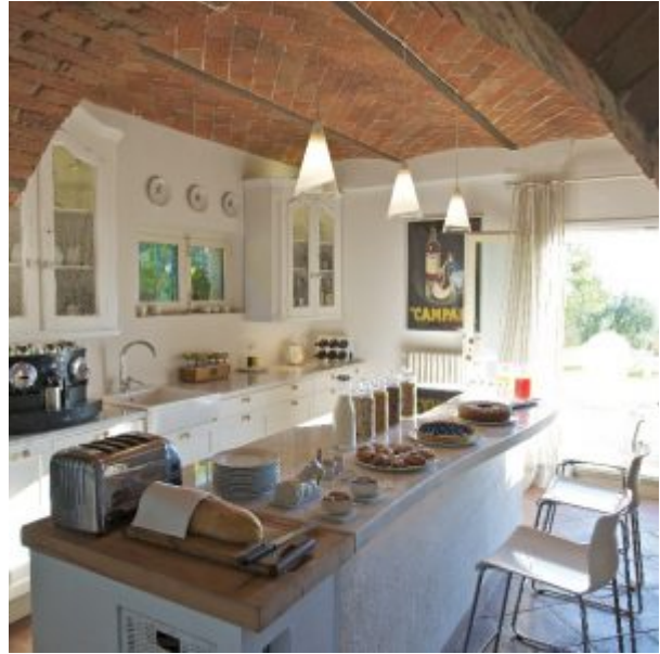
Fontelunga Villa - interior breakfast room