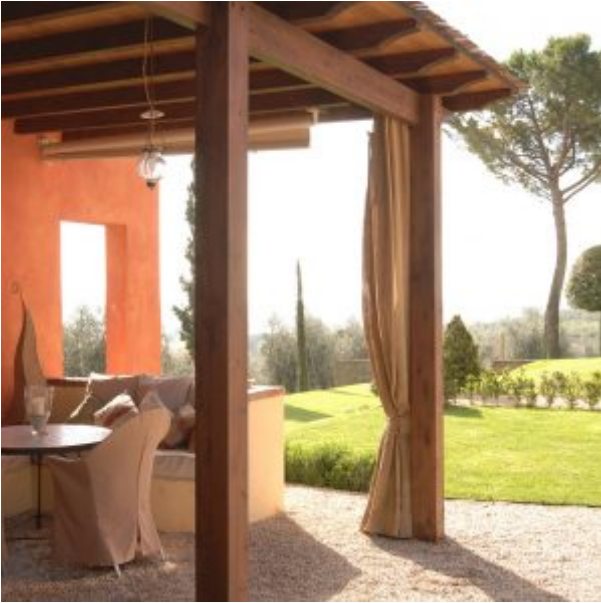
Fontelunga Villa - exterior gazebo and lawn