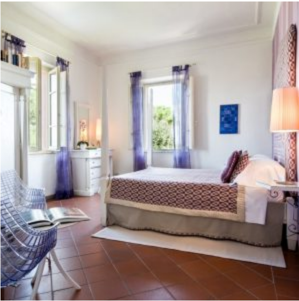
Fontelunga Villa - Ametista room