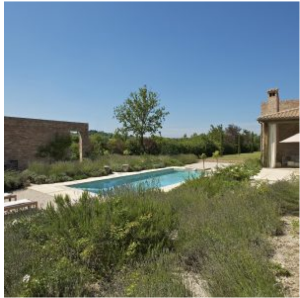
Villa pool and garden