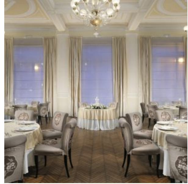
Butterfly event room