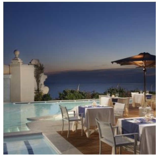
Dining by the rooftop pool in summer