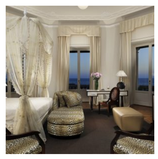
Junior Suite Deco Style