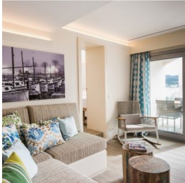
Seven Pines Resort Ibiza - Suite Interior