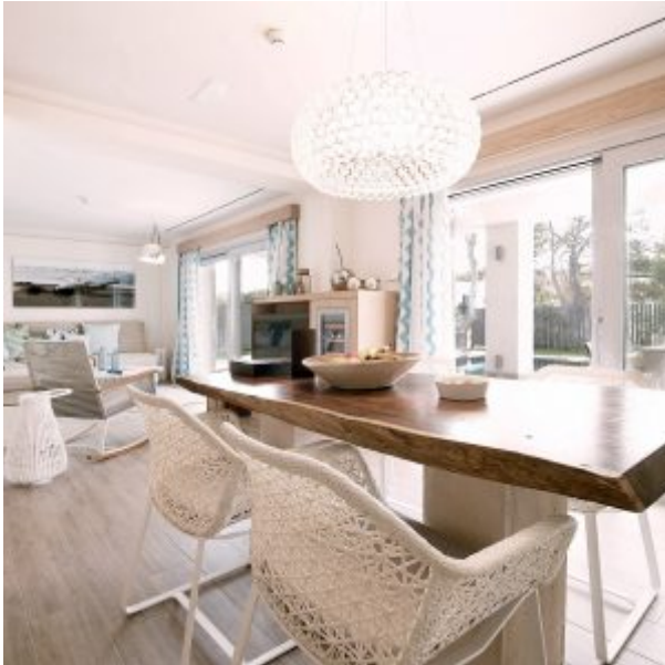
Seven Pines Resort Ibiza - Suite Interior