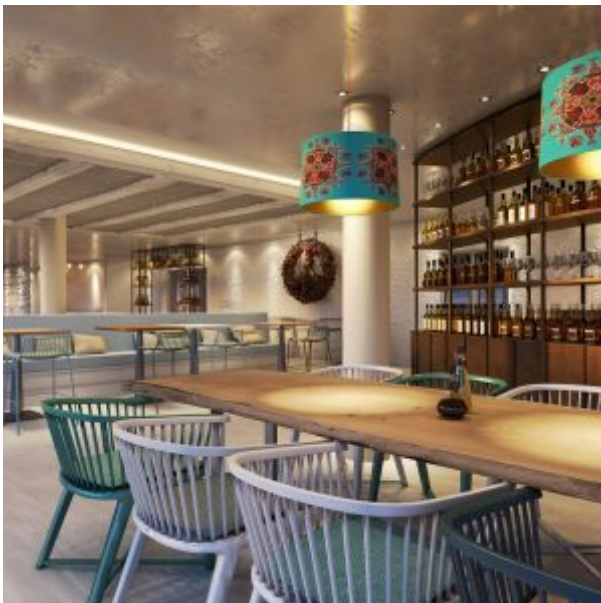
Seven Pines Resort Ibiza - Cone Club