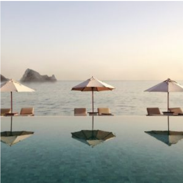
Seven Pines Resort Ibiza - Swimming Pool