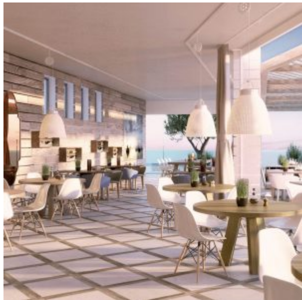
Seven Pines Resort Ibiza - The View