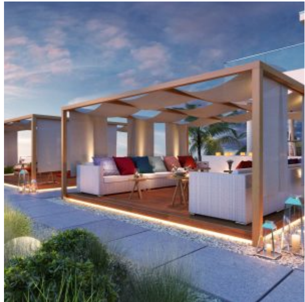
Seven Pines Resort Ibiza - outdoor seating with sea view