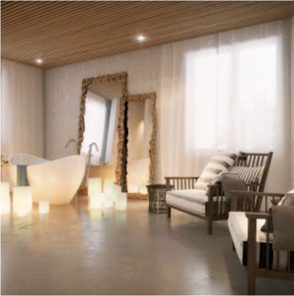
Seven Pines Resort Ibiza - The Spa