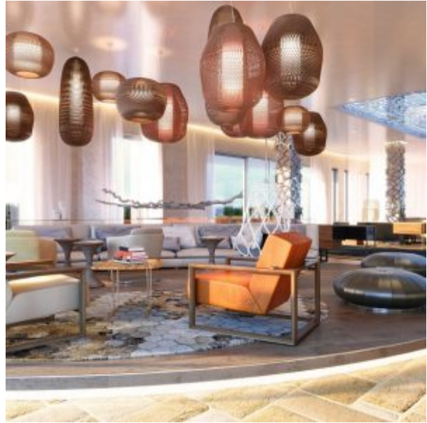
Seven Pines Resort Ibiza - The Lobby