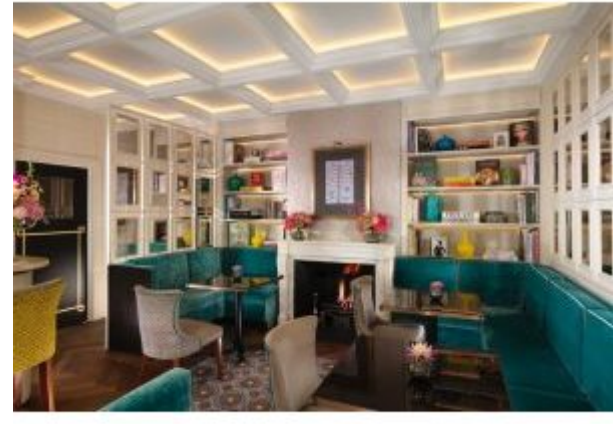
The Drawing Room, Indian inspired tea-room