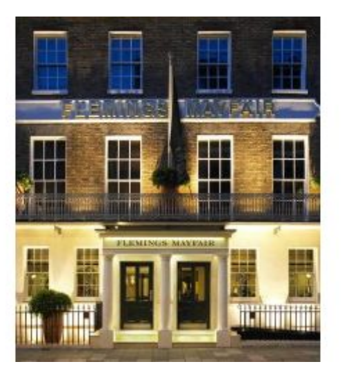
Located in the heart of Mayfair

In recognition of this joint venture, The Telegraph has highlighted the restaurant as being one of the top five hottest openings for summer 2016