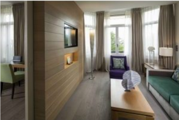
Suite Lac - Living Room