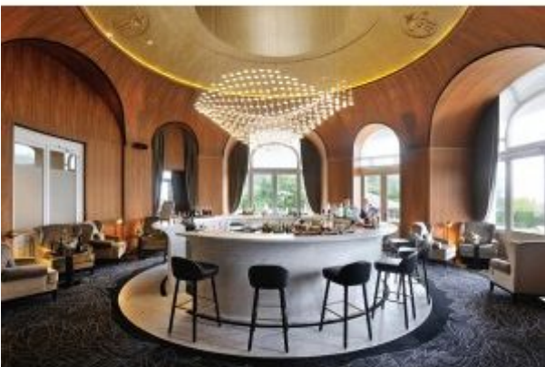
Hotel Royal bar