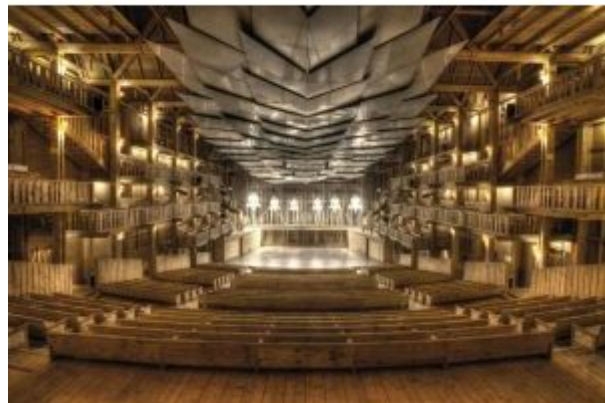
La Grange au Lac