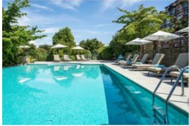
Hôtel Ermitage Swimming Pool