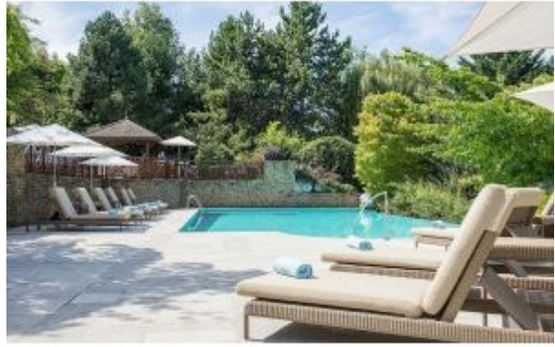
Hotel Ermitage pool