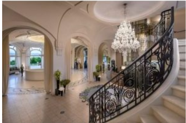
Hotel Royal entrance