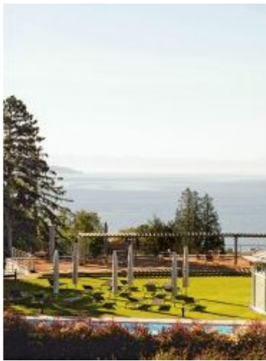
Terrasse Villa Bellevue