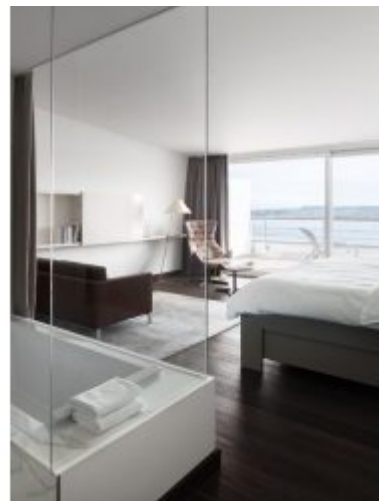
Junior Suite, Villa Belgrano