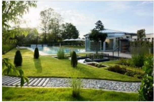
New Gardens & Swimming Pool