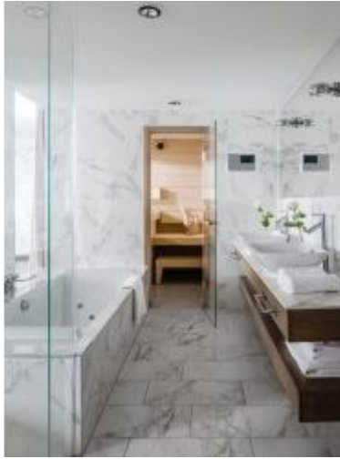
Bathroom, Villa Belgrano