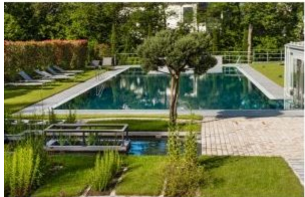
New Gardens & Swimming Pool