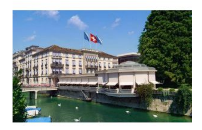
Hotel Exterior Baur au Lac Park