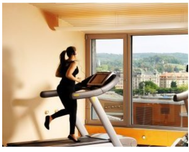
Fitness Centre with view