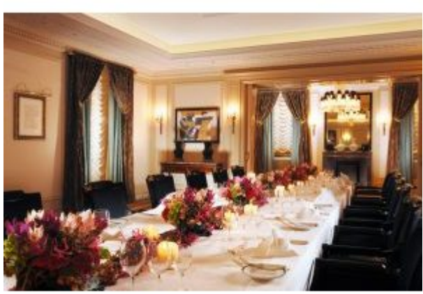
Salon II Salon I