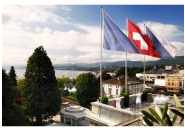
Pavillon restaurant View of the lake from the hotel