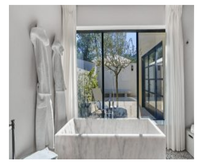
A Villa Suite at Villa La Coste