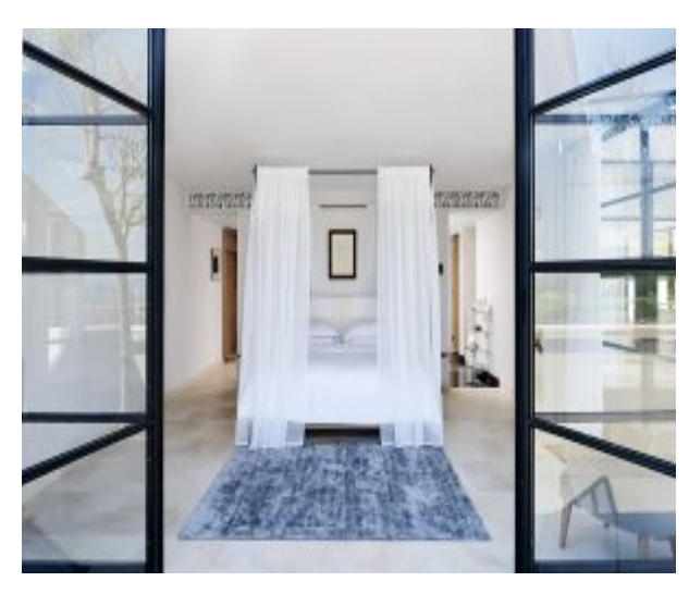
A Villa Suite, each offers zen uncluttered comfort with expansive views.