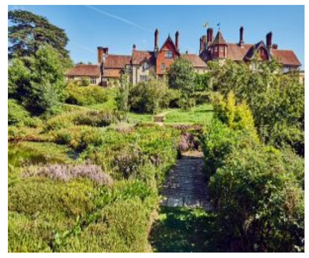
The gardens at Cowdray House, West Sussex