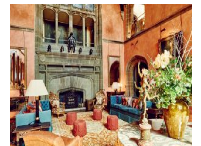
The Hall at Cowdray House, West Sussex

Click here to find more information on Bodhimaya Retreats at Cowdray House, West Sussex