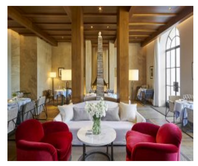
Villa La Coste, Provence