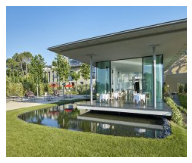
Château la Coste, the international destination for art, architecture and natural beauty