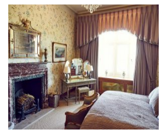
A bedroom at Cowdray House, West Sussex