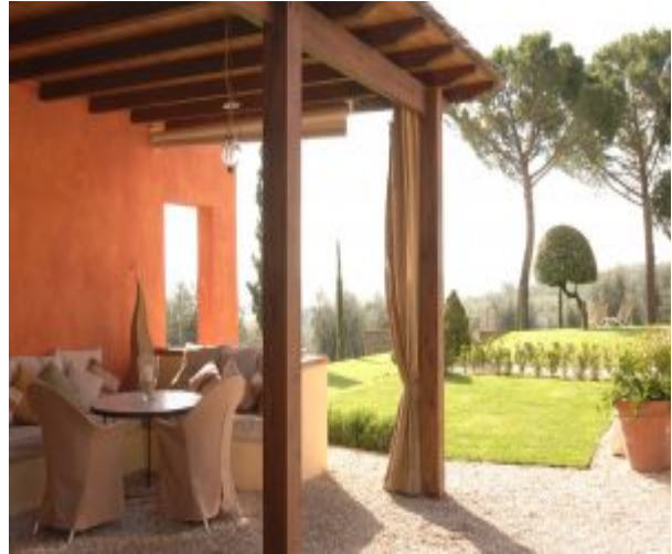
Fontelunga Villa - exterior gazebo and lawn