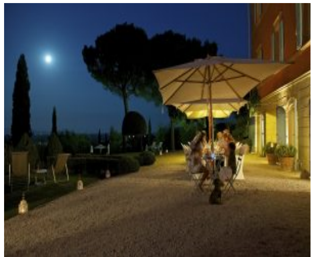
Fontelunga Villa - exterior dining on the terrace