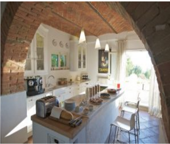
Fontelunga Villa - interior breakfast room