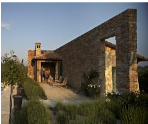
Villa lounge from the garden

Fontelunga seamlessly blends the colours and textures of traditional Tuscan style with contemporary design and facilities. Bedrooms are styled with shabby-chic furniture in white washed tones and luxuriously vibrant fabrics, while the communal areas compliment the building's traditional interior brickwork - including brick barrel vaulted ceilings and kitchen open fireplace - with vintage furnishings, frescoed ceilings and unique artworks by the likes of Guttuso and Canevari, as well as London-based painter Jim Hanlon.