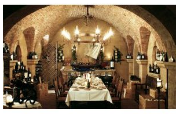
Cave dos Vinhos, wine cellar