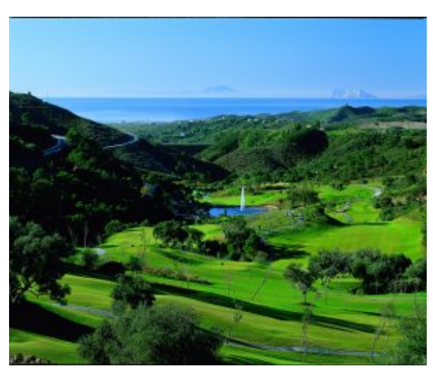
18-Hole Golf Course