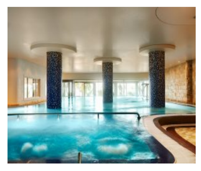
Marbella Club Spa