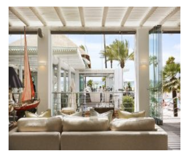
Puente Romano Sea Grill