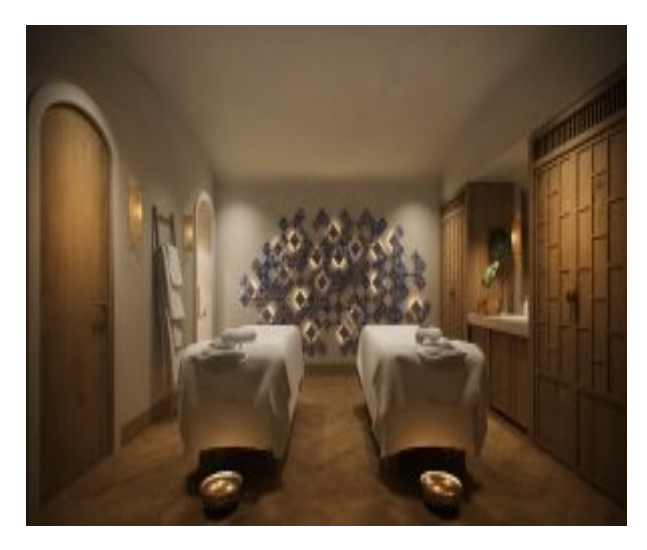
Six Senses Spa treatment room