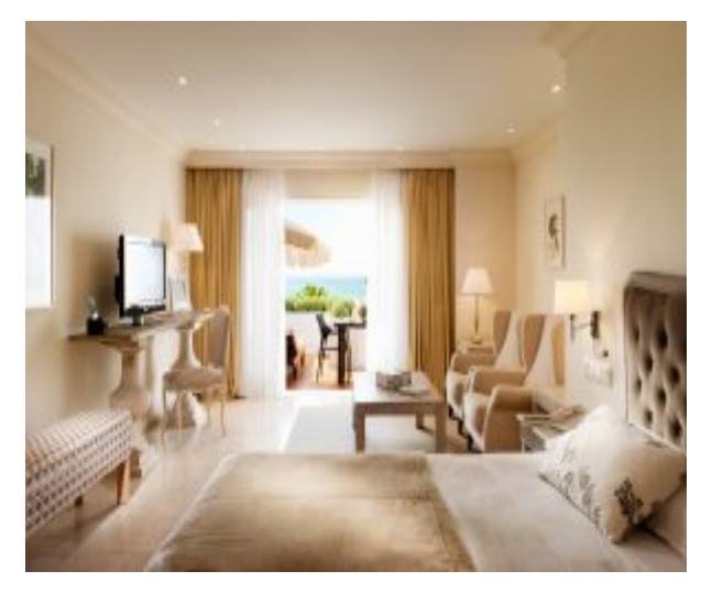
Grand Junior Suite