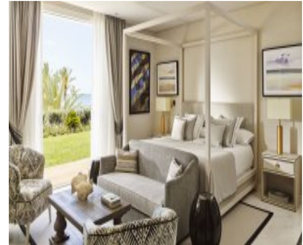
Villa Perez bedroom