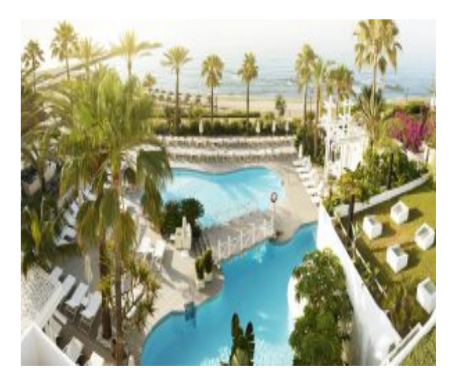
Puente Romano Pool