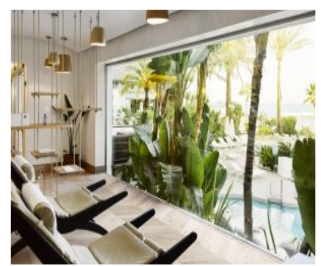
Six Senses Spa relaxation room