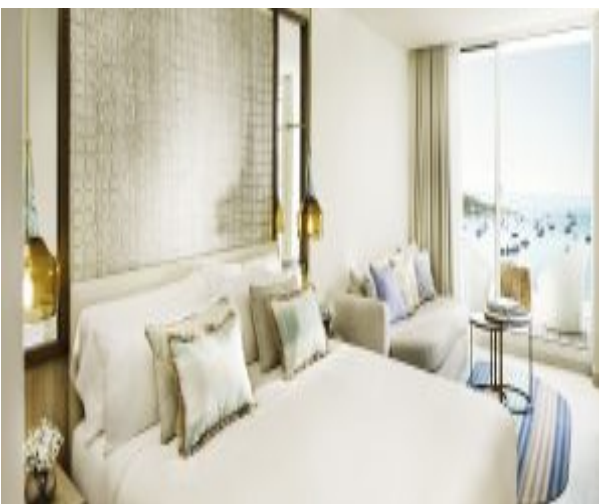
Junior Suite Sea View