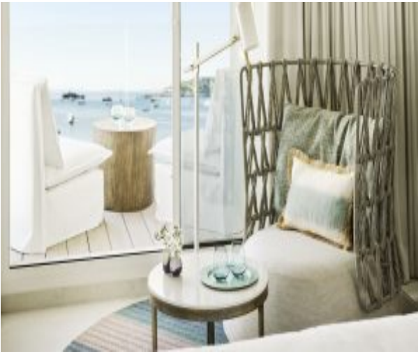
Deluxe Sea View Room