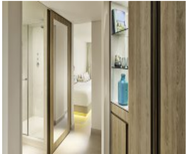
Guest Room Hallway