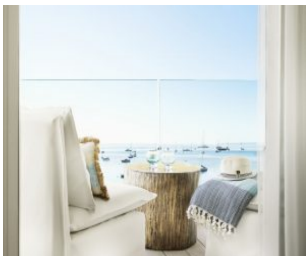
Deluxe Sea View Terrace

Pool Bar: sea views and a relaxed poolside setting make the Pool Bar the ideal spot to spend the day. Guests can order from the bar or enjoy waiter service, The Pool Bar offers an extensive menu, which means visitors can snack on fresh sushi rolls and fruit platters without ever leaving their sun lounger