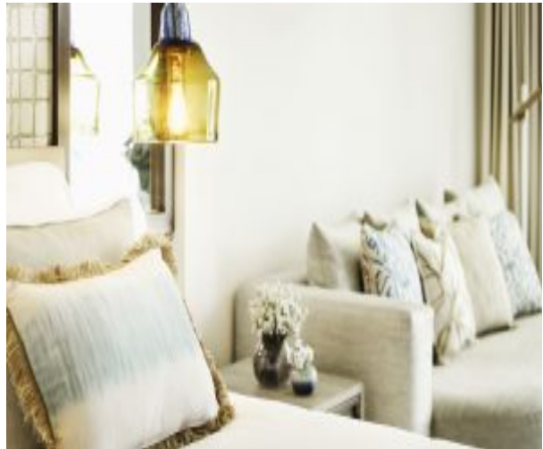
Junior Suite Sea View