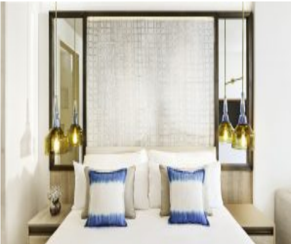
Junior Suite Sea View