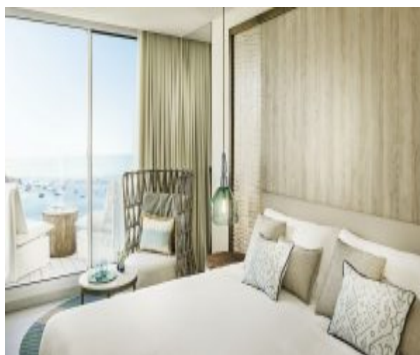
Deluxe Sea View Room