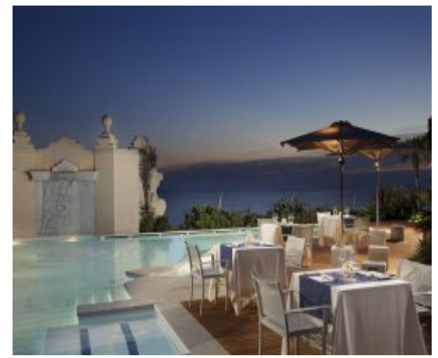
Dining by the rooftop pool in summer