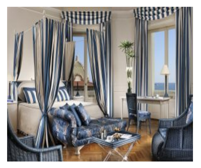
Junior Suite Imperial Style

The Grand Hotel Principe di Piemonte Wine Cellar houses up to 800 labels of prestigious wines which are predominantly Tuscan, but also from other Italian regions and countries.