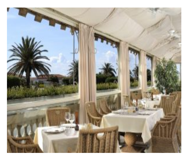
Regina restaurant veranda