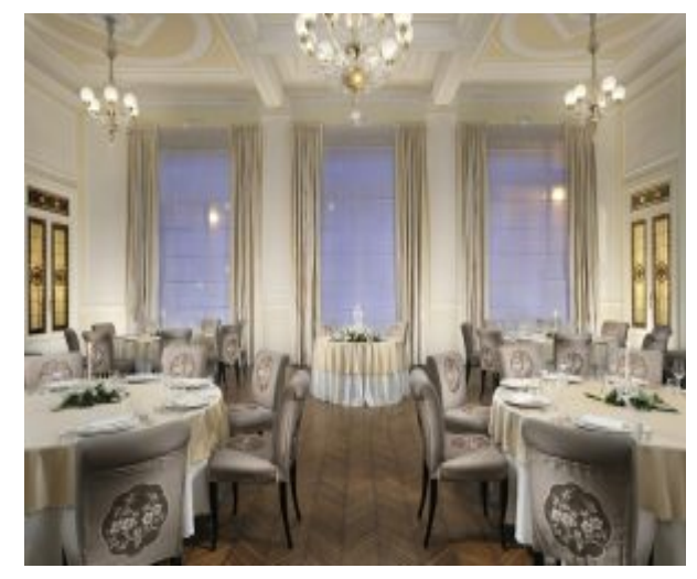
Butterfly event room