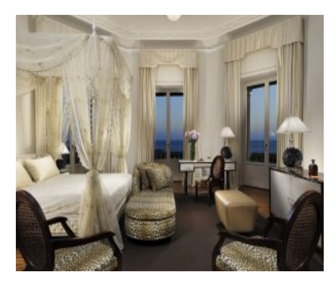
Junior Suite Deco Style