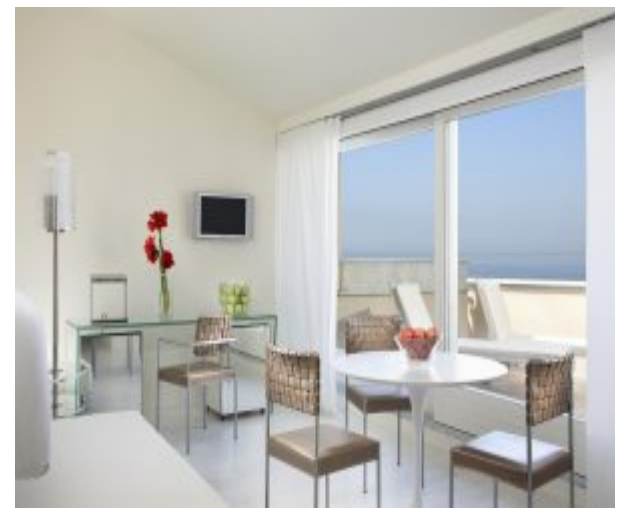
Suite Living Room modern style