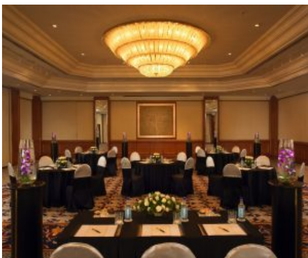
Conference Round Table