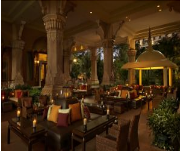
Library Bar Terrace