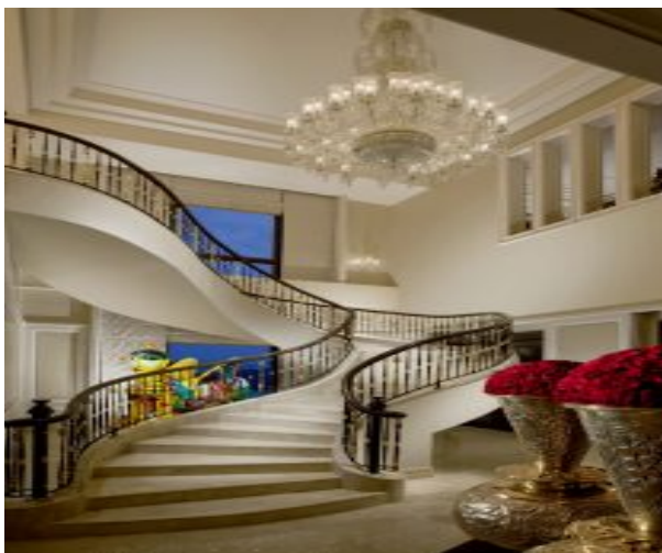
Grand Stair Case