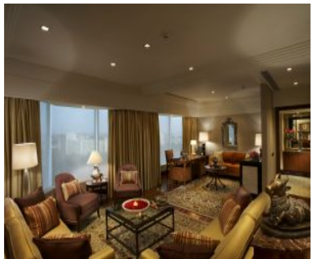
Suite Living Room