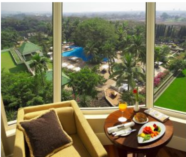
View from Guestroom