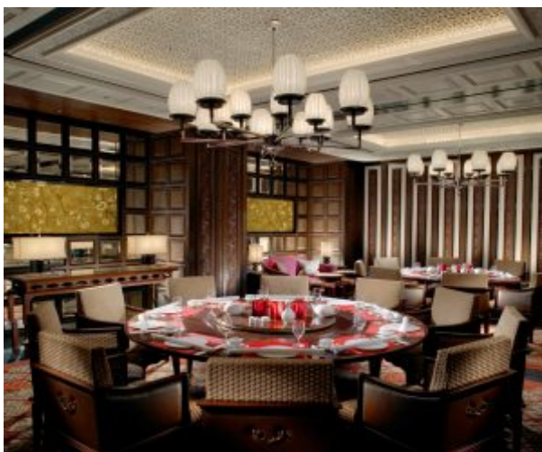
China XO Private Dining