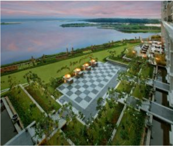
Sea View Courtyard