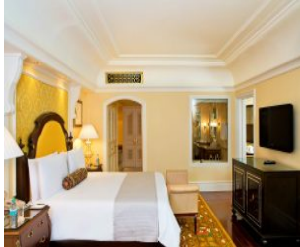
Tower Suite Bedroom