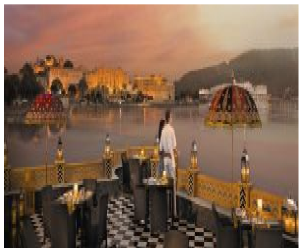
Sheesh Mahal terrace overlooking the lake