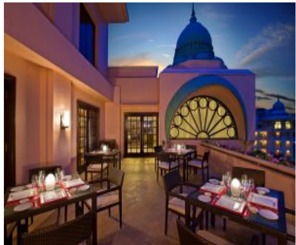
Le Cirque- Signature Alfresco Dining