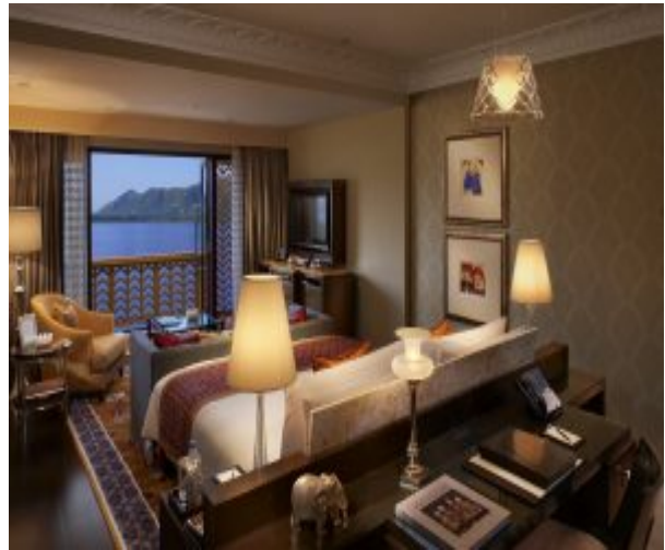
Lake View room