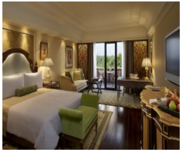
Royal Premiere Room