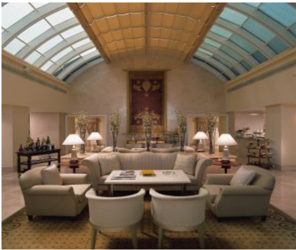
Royal Club Restaurant