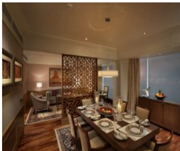
Konark Dining Room