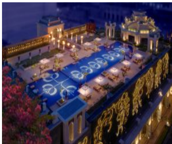
Flower Swimming Pool