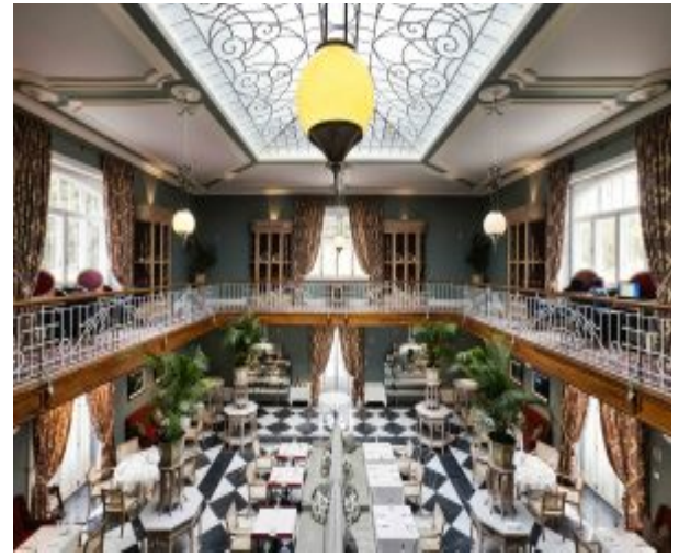
Suite Winter Garden Restaurant