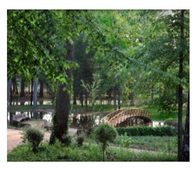
The Park and outdoor events space