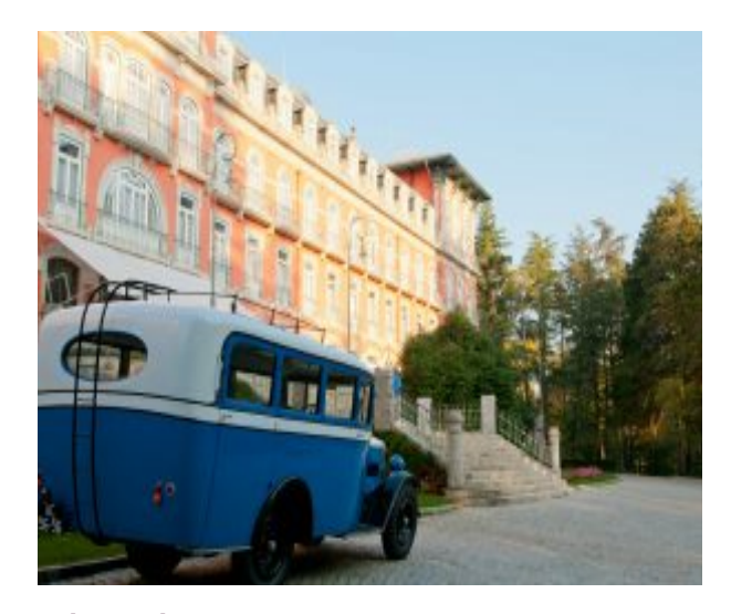
Vidago Palace Bus