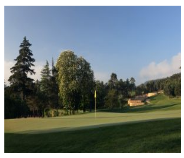
18-Hole Golf Course