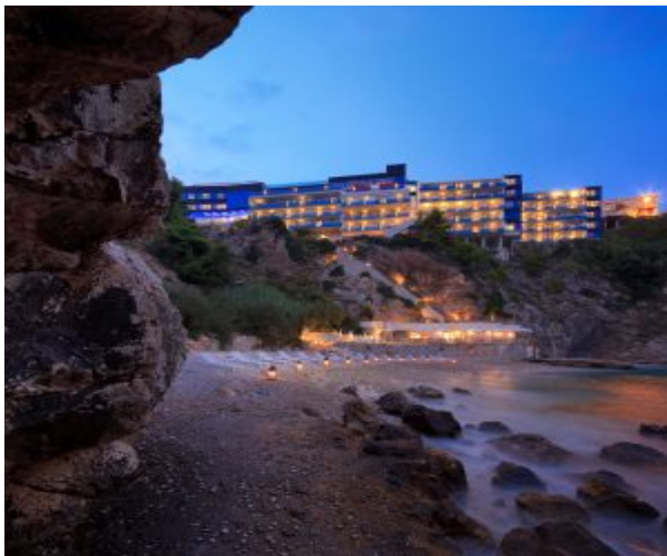
Hotel View from Beach