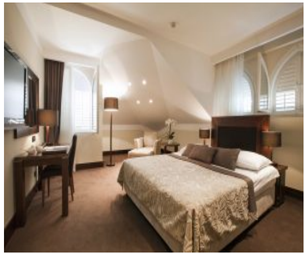
Villa Orsula Deluxe Suite