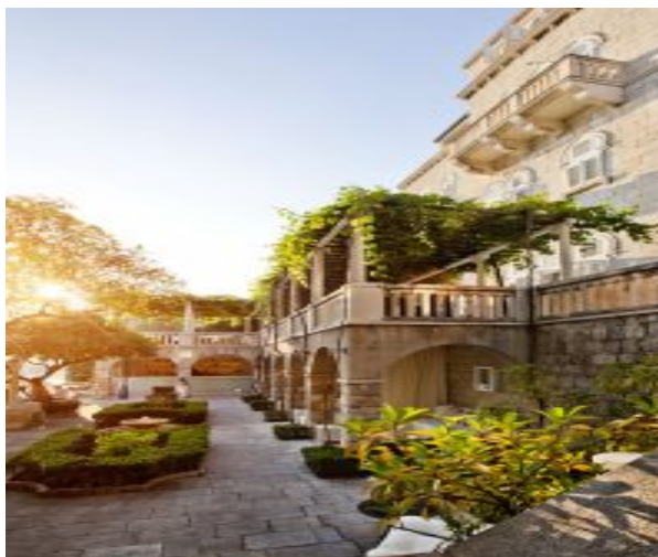
Villa Orsula Victoria Restaurant terrace