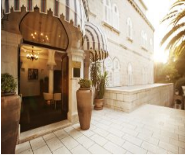
Villa Orsula entrance