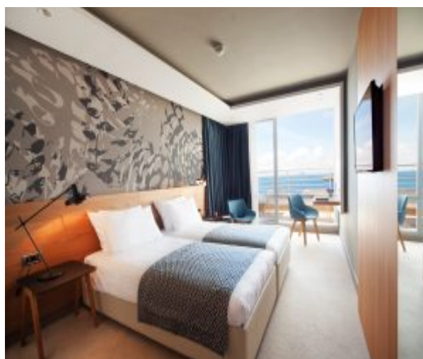
Superior Double Room