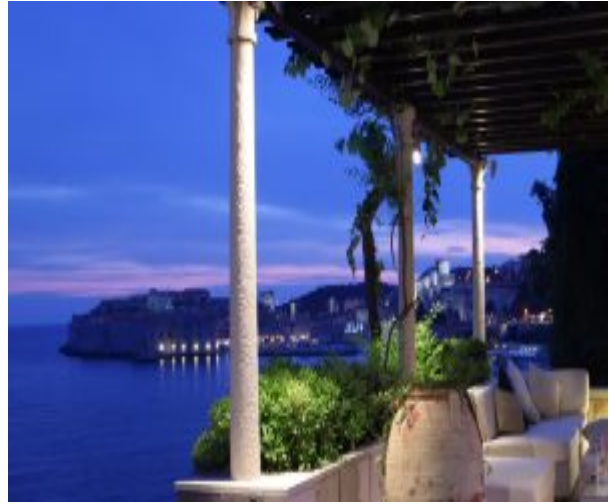
Villa Orsula Dubrovnik Old Town view