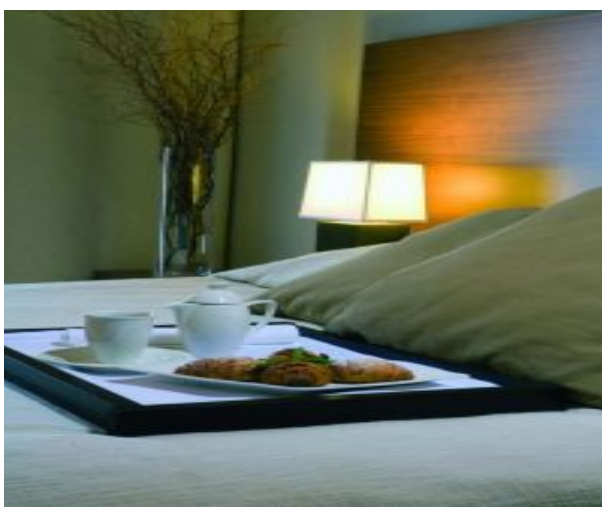
Breakfast in Bed