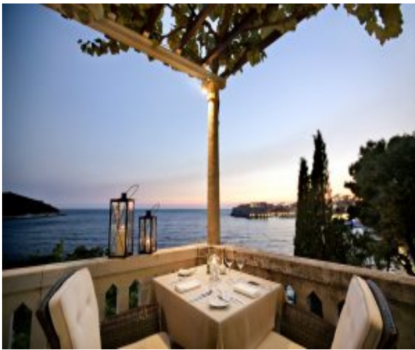
Villa Orsula Victoria Restaurant