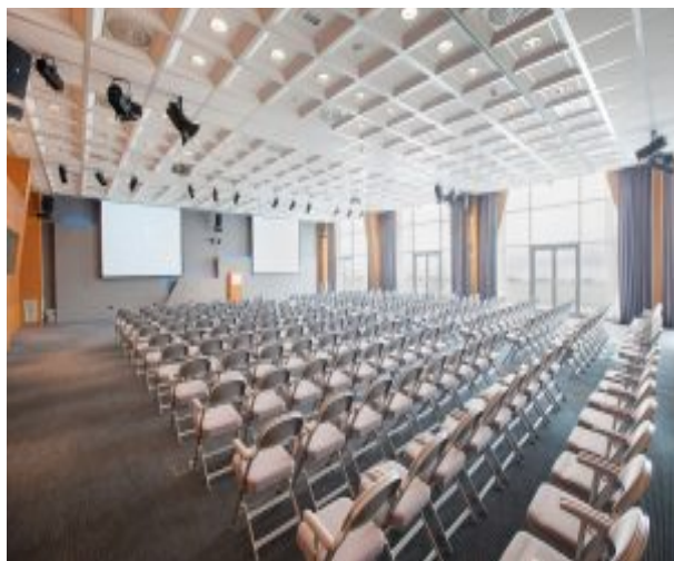
Mare Conference Room