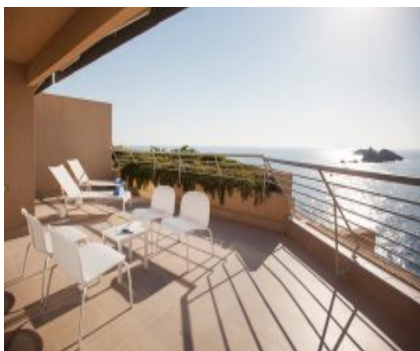
Deluxe Suite Balcony