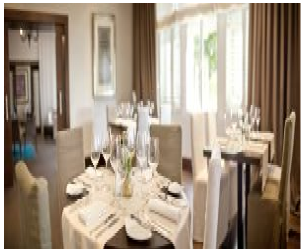
Villa Orsula Victoria Restaurant