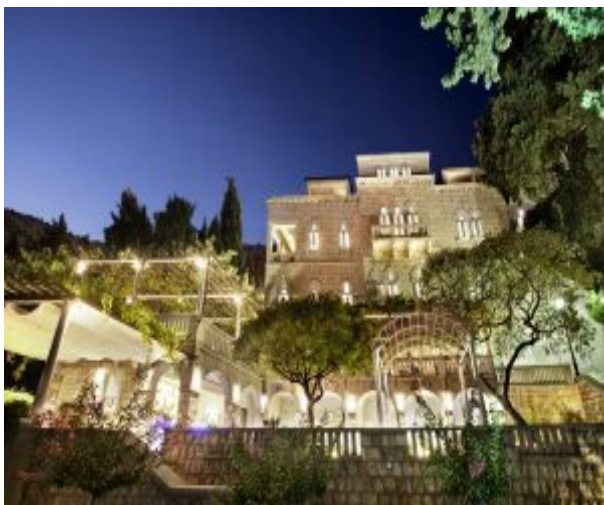
Villa Orsula by night

The property was originally built in 1939. Artists Roberto Matta and Victor Vasarely were amongst those who worked on its immaculately refurbished interiors. Large canvases of the distinctive architecture of the Old Town feature throughout