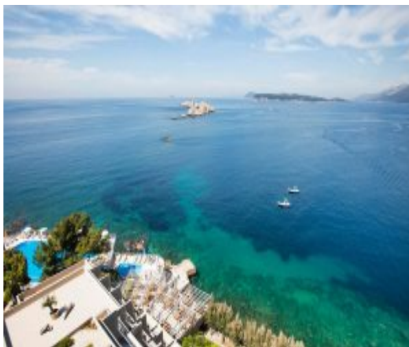
Sea View from the Hotel