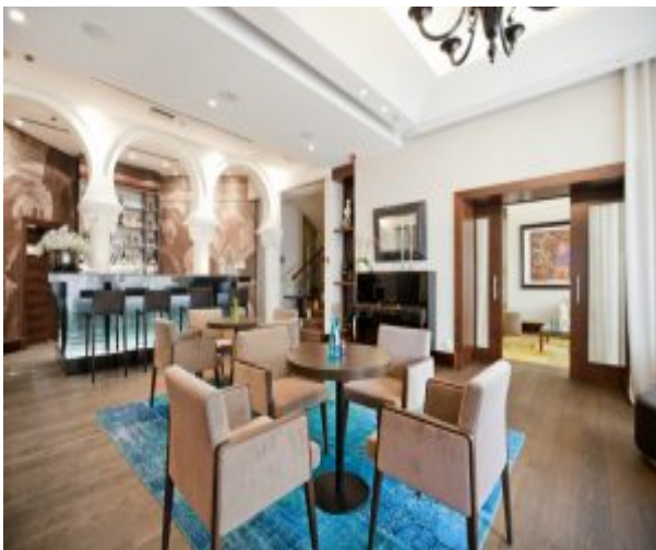
Villa Orsula Lounge