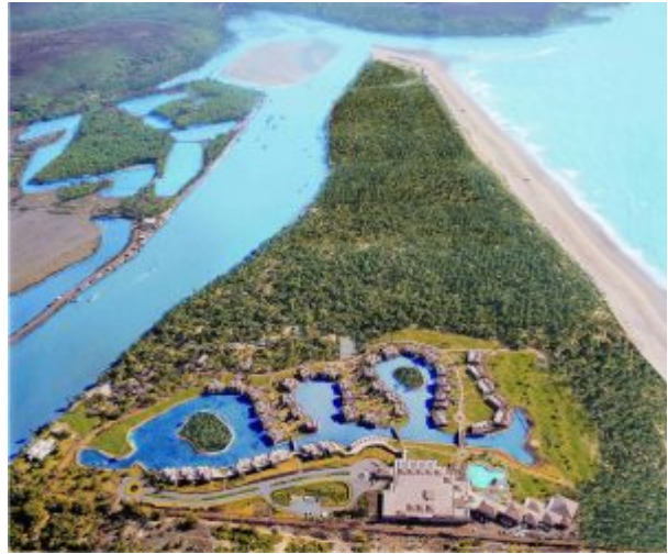
Aerial View of Property