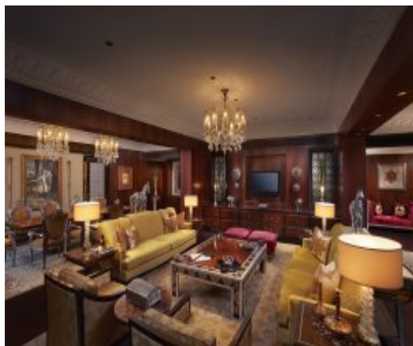
Maharaja Suite Living Room