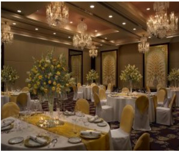
Ball Room Dinner set up