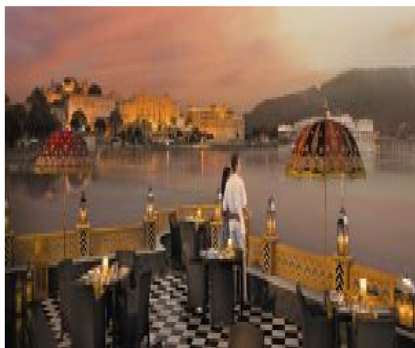
Sheesh Mahal terrace overlooking the lake