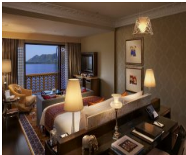
Lake View room