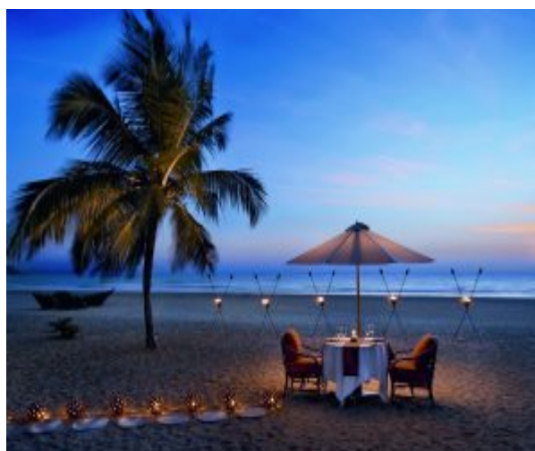
Romantic Dining on the Beach