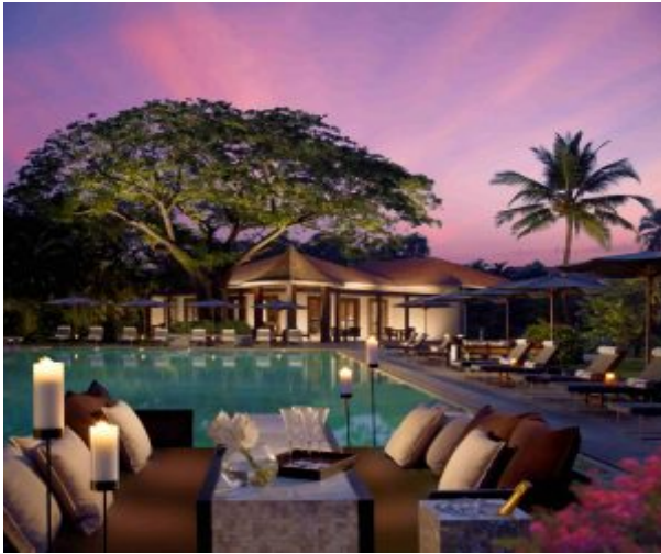
Club Lounge Pool