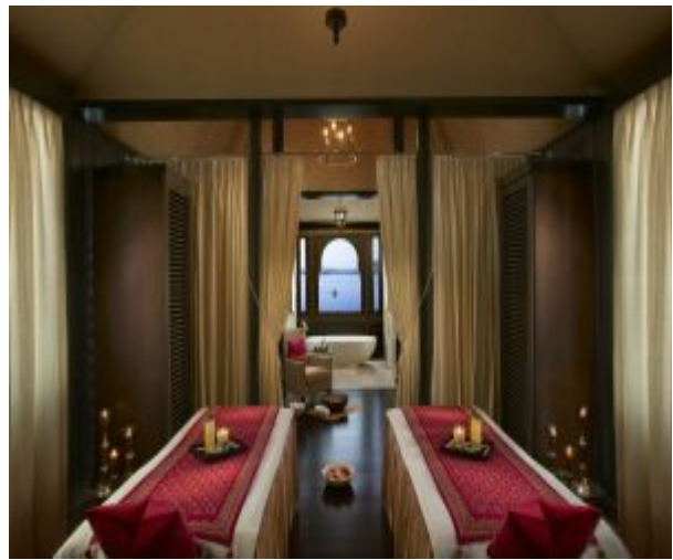
ESPA spa treatment room