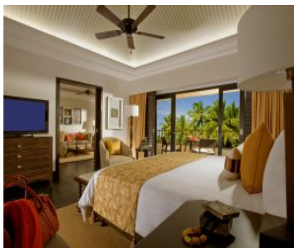
Lagoon Suite Bedroom