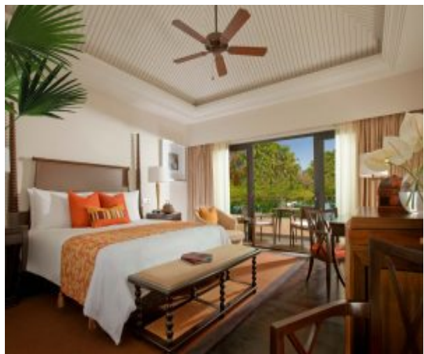
Lagoon Terrace Room