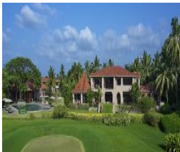
Club Exterior from Golf Course