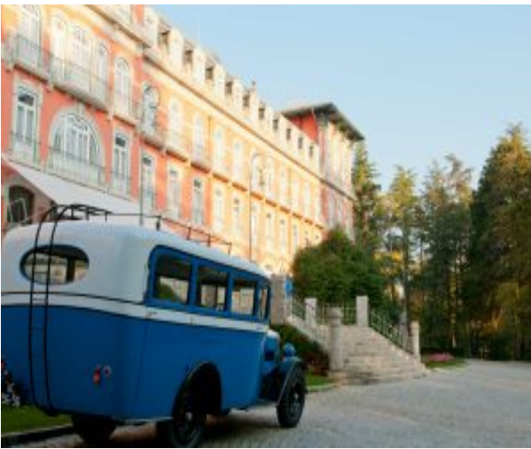
Vidago Palace Bus