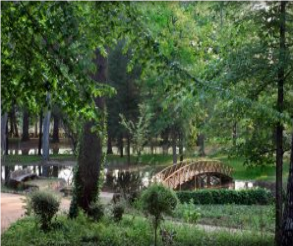
The Park and outdoor events space