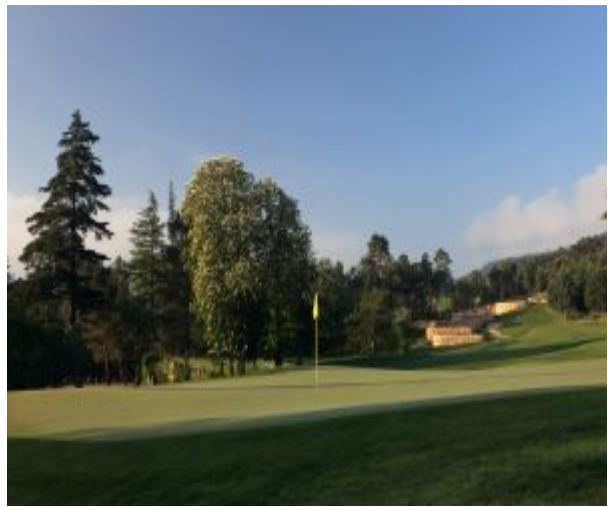
18-Hole Golf Course