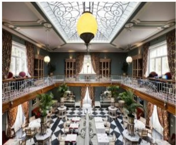
Winter Garden Restaurant