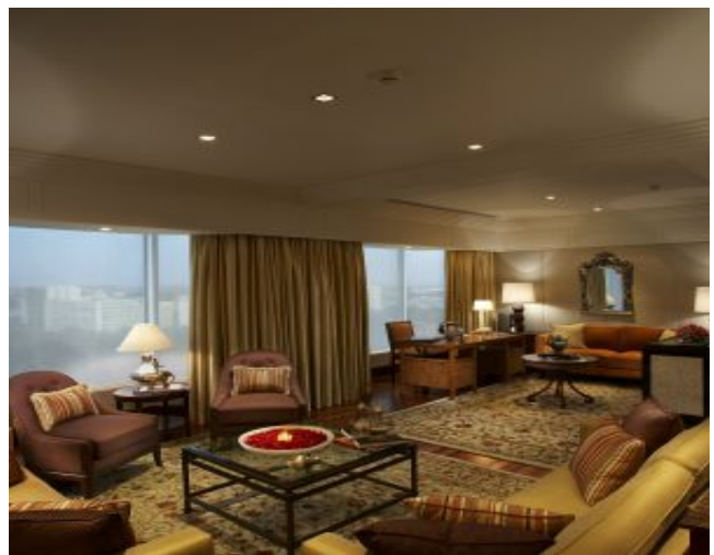
Suite Living Room