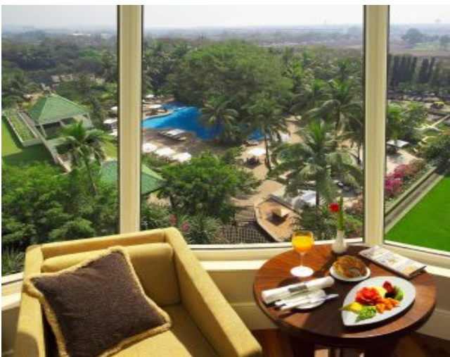
View from Guestroom