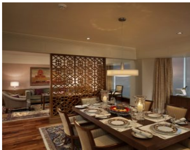
Konark Dining Room