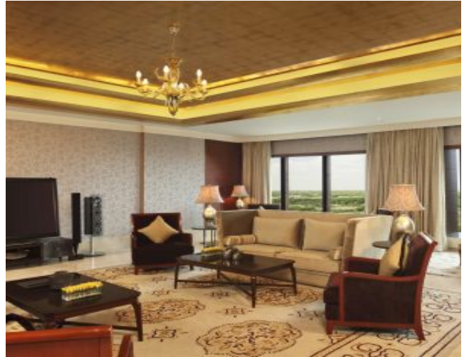
Presidential Living Room