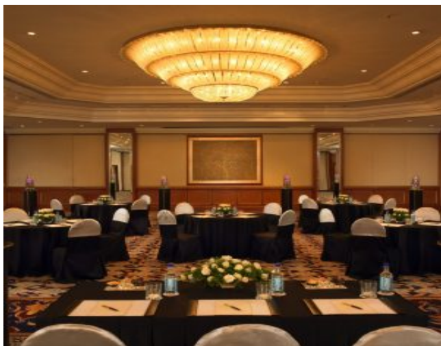
Conference Round Table