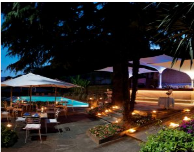
T Pizza by night