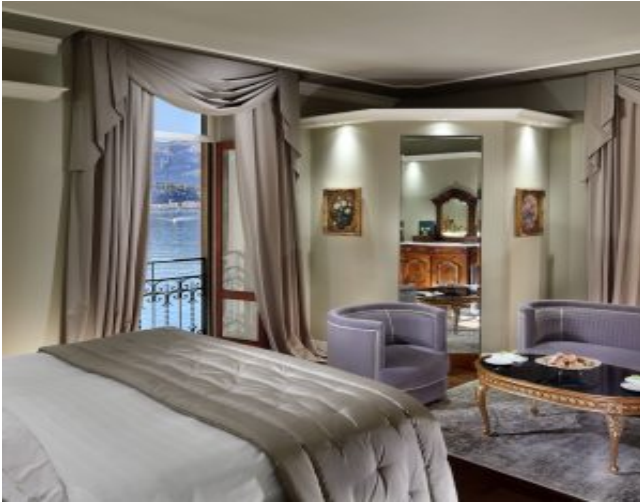
Lake View Deluxe Room