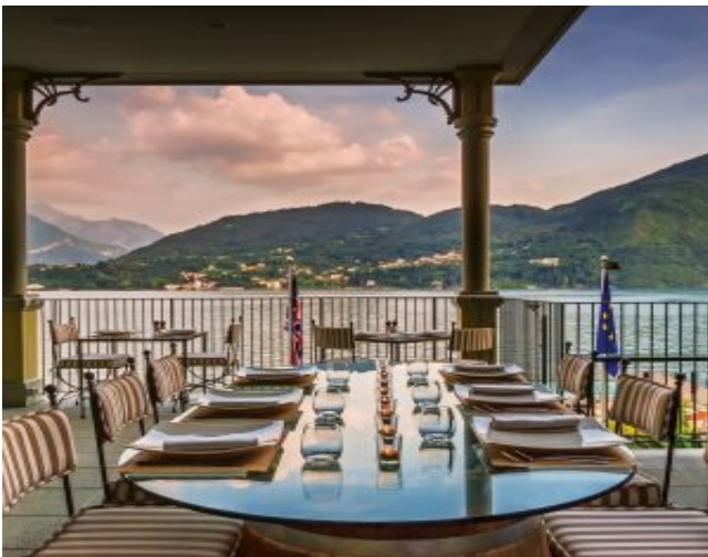
L'Escale Fondue & Wine Bar veranda