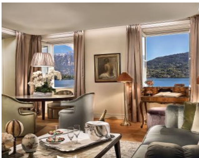
Suite Emilia - Living Room

A collection of signature wellness experiences have been designed by ESPA exclusively for T Spa to evoke a true feeling of Lake Como while generating outstanding results for the mind and body