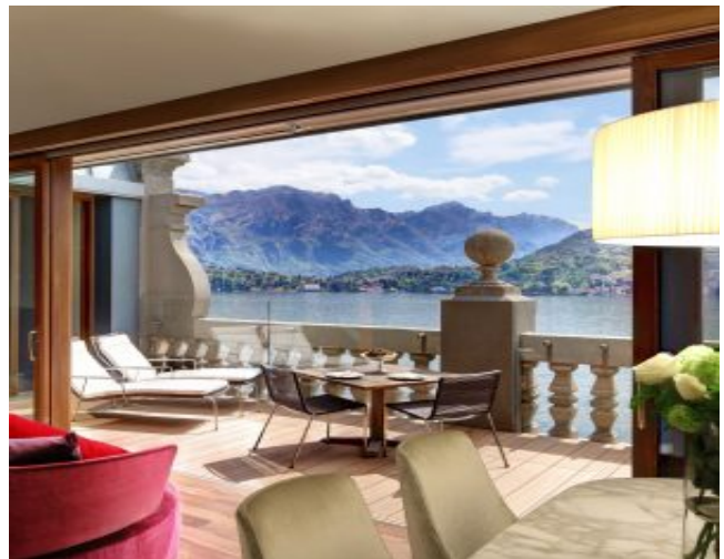
Rooftop Front Suite Living Room