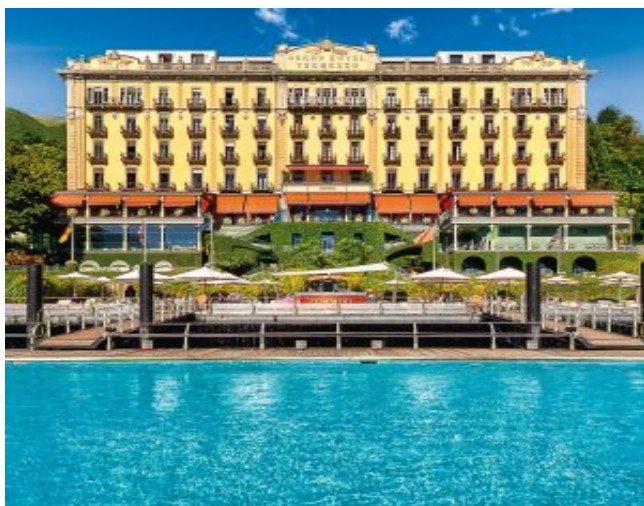
Grand Hotel Tremezzo

World-renowned chef Gualtiero Marchesi, the first non-French chef to be awarded 3 Michelin stars, is credited for having made the biggest contribution to the evolution of Italian cuisine and its popularity worldwide. He works in conjunction with the Chefs at the hotel to bring guests the true flavour of the local cuisine, including his signature dish "Saffron Risotto with Golf Leaf"