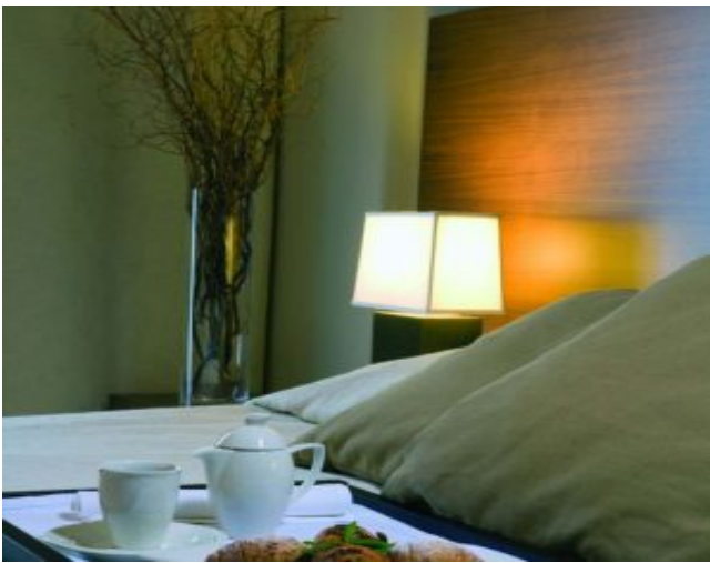
Breakfast in Bed