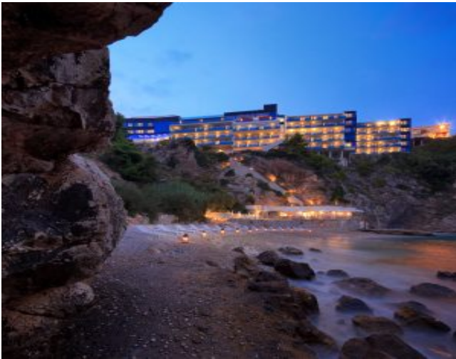
Hotel View from Beach