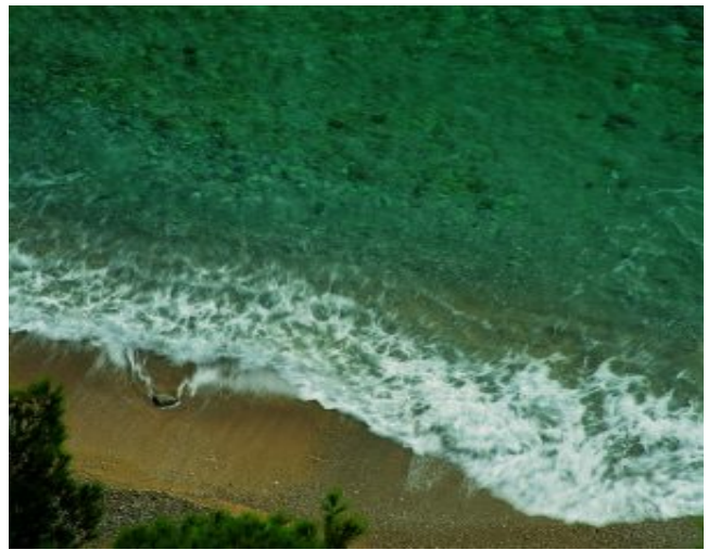
Hotel Bellevue Beach