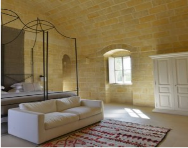
Trapana South Suite