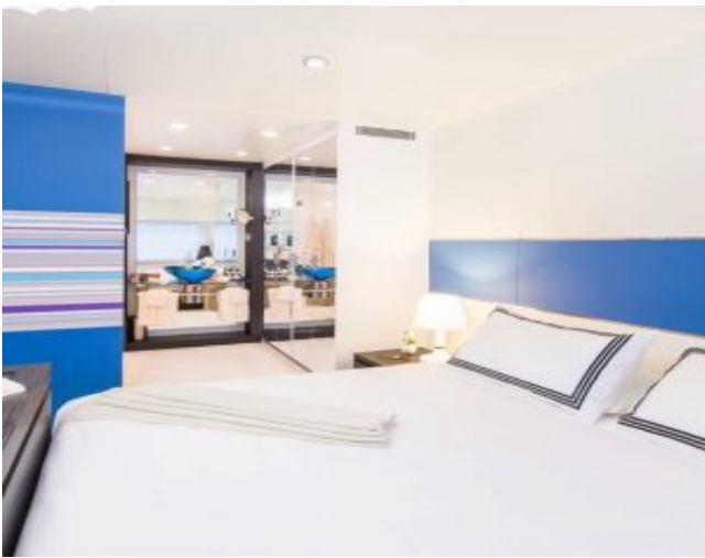
VIP Cabin Bedroom