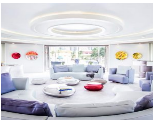
Bridge Deck Salon