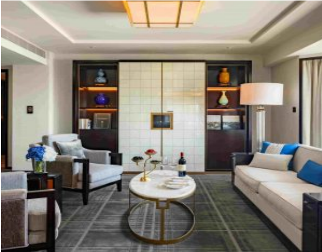
The Beijing Suite, Living Room