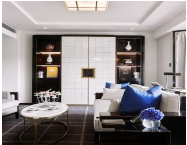
Classic Cantonese at Huang Ting